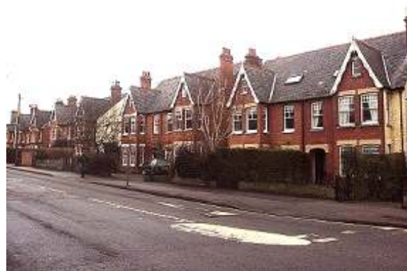
320 to 328 (even nos.) High Street

Semi-detached pair of villas; c.1900. Two storeys and attic storey. Slate roof with gable ends and clay looped ridge tiles. Brick stacks at each end set forward and back from the ridge. Steep pitched projecting gable roofs to full-height bays have shaped bargeboards and spike finials. Downpipe to each end and to centre.