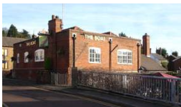
The Boat PH, Gravel Path

Purpose-built public-house. Earlier origins but largely rebuilt in C20th. Twin hipped tiled roofs largely concealed behind brick parapet with clay ridge and hip tiles. Brick stack to left flank wall facing onto Gravel Path and tall stack to single storey range at right end. Downpipes at each end and to centre, all with hoppers. Two storeys, but appears as single storey from Gravel Path/George Street. Single storey range attached to right end. Red/orange brick with chamfered cornice and plinth bands. Brick on edge to parapet. 2 window range, 2-light casement window to left, 6 panes per light and 3-light window to right 6 panes per light with louvred vent to top of left hand casement. Both have cambered arched heads. To left side there is a shallow projecting glazed doorway with cornice breaking forward and glazed overlight and sidelights; two-leaved outer door and half-glazed, half-panelled inner door. To right is flat-roofed projecting bay with similar glazing to the French windows and panelled bases. Similar French windows to single storey range. Steps down from road on left side to paved area which is bounded by brick wall with metal