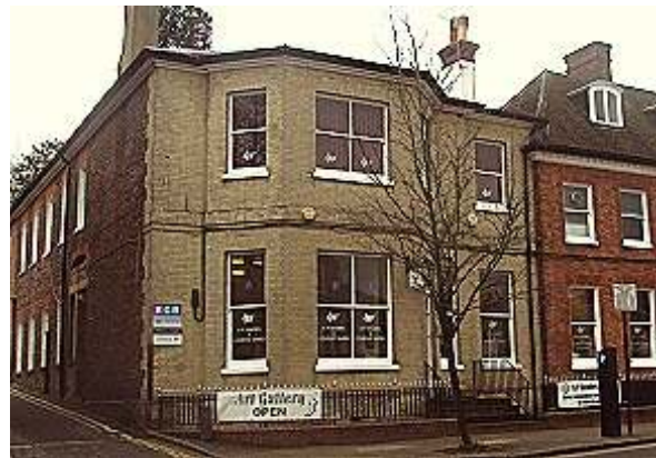
111 High Street

No 111 High Street is a former house, now offices, turning the corner of the High Street into Rectory Lane. Two storeys with basement. Mid C19th. Shallow hipped slate roof. Rendered stacks at each end with circular pots. Downpipe at right end. Unrendered buff brick to High Street with simple plat band and dressings in the same brick, including toothed quoins at the corner, otherwise purple brick with red brick dressings to Rectory Lane. High Street elevation has wide canted bay with hipped roof, an entrance now into right cant and slightly recessed flanking bay; 5 window range and blocked former principal entrance door extending up Rectory Lane, further extended in C20th at rear.