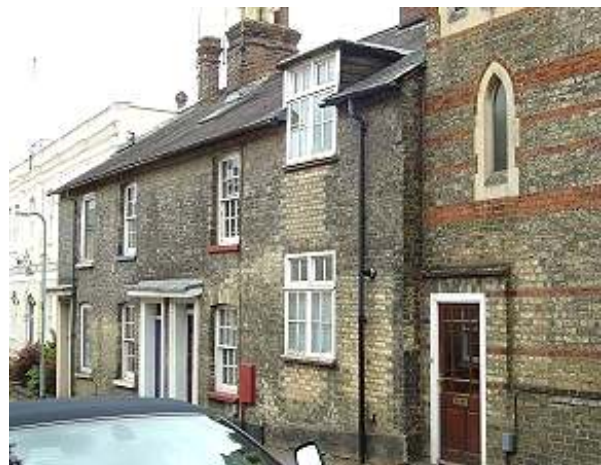
1, 2, 3 & 4 Ravens Lane

No. 2 is mirror image of No. 3 with similar sash on each floor. Nos. 2-4 retain their doorcases with stone steps, moulded surrounds and rectangular overlights (No. 2 has been reduced). The cornices break forward, those of Nos. 2 and 3 are conjoined. No. 4 has 6-panelled door, No. 3 has 4-panelled door, No. 2 has 6-panelled door incorporating 'Georgian' fanlight. All original window openings have cambered brick arches. No. 1 has had original openings blocked and a 2-light casement inserted on each floor, each