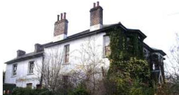
The Grey House

Undergoing renovation at time of survey. (September 2013)