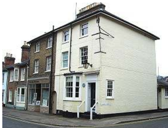
21 & 22 Castle Street

No. 22 retains its original white gritty mortar. Its fenestration mirrors No. 21 at first and second floor levels with a pair of 3-over-6 paned hornless sashes to the top storey over a pair of 6-over-6 paned hornless sashes to the first floor with finely constructed rubbed