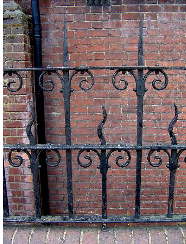
Examples of ornate iron work on boundary walls