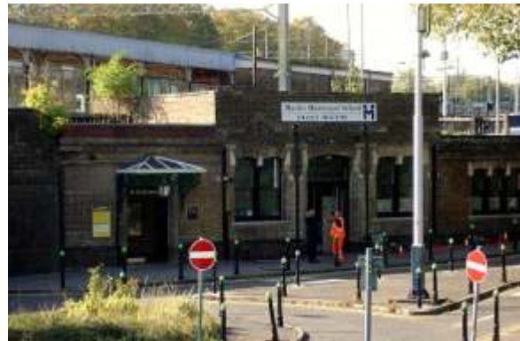
The Brownlow Rooms

The construction of the Birmingham to London Railway began in 1834; the local contract was given to W. & L. Cubitt who employed 700 labourers at its peak of building works. It can be seen as having been partially