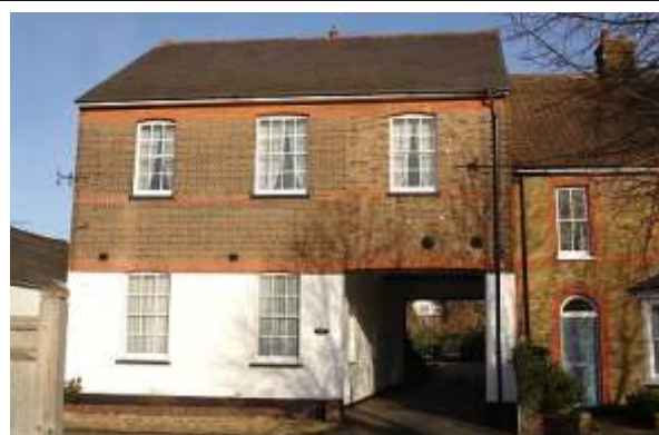
1, 2, 3, 4 & 5 Mason's Yard

Nos. 1,2,3,4 & 5 Masons Yard consists of a tall 2 storey late C19th range fronting Chapel Street and a rear range converted in 1990s to residential use, extending to rear left side and accessed through carriage way at right end of front range. The front range is of brick (rendered up to first floor) with slate roof with gable ends. The area above the carriage way has been rebuilt. Blind gable to left end. Single downpipe to right end. Plum brick with strings of red dressings to the eaves, below upper storey windows and at first floor level. The front range consists of a three window range of 6-over-6 paned sashes flanking an 8-over-8 paned sash to the upper storey. Ground floor has two 6-over-6 paned sashes to left of carriage entrance which has slightly cambered arch. Two 2-over-2 paned sashes on flank wall of carriageway, and window in former doorway at north end. Mechanism with weights for c