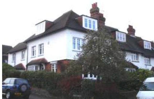
1 North Road

No 1 North Road is house that turns the corner of North Road and Charles Street. Early C20th. Tiled roofs hipped to main range on the corner with crested ridge tiles. Downpipe to left end of North Road elevation and right end of Charles Street elevation. Unrendered brick stack at right end of Charles Street elevation. Flat-roofed 3-light dormer to each elevation. Upper storey is painted roughcast render, lower storey of unrendered red brick. Two storeys with attic storey. Room to each side of entrance on North Road elevation, with lower service range extending southwards up North Road. All windows have 4 paned upper sashes, single pane to lower sashes. North Road elevation has two twin sashes over tiled hipped porch supported by shaped timber brackets and extending over canted bay window to left with triple sash to centre and single sashes to the cants. Steps up to 5-panelled door, the upper panel glazed, with glazed overlight. Twin sash to right with timber lintel. Similar fenestration and door to service range to left. Near symmetrical elevation to Charles Street with two triple sashes over canted bay window