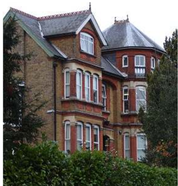
15 Kings Road

Dentil platband above the porch lintel is carried across the façade. Left side has square bay rising from basement to attic gable which has wide 3 light window with segmental arch. Heavier toothing to frieze over