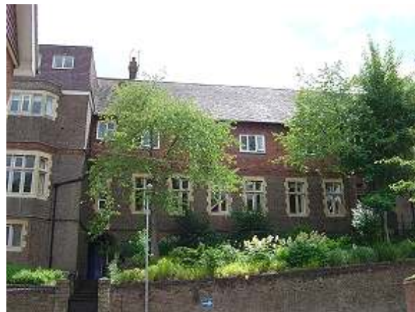
Incents, Chesham Road

The projecting north wing has a canted bay to the front (originally with a gabled roof) with 4 light cross-mullion window continued round as single sidelights to the cants to the two principal storeys and 3-light