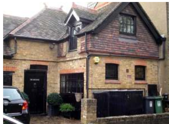
The Coach House, Station Road

The Coach House is a converted service building formerly serving No 4 Station Road (q.v). Early C20th. Single storey with attic storey. Tiled roofs with crested ridge tiles surviving to the forward wing and partly to the raised central section; swept finials to the hips and gables. Hipped end to left end and to raised central section, gable end with bargeboards to forward wing. Full gabled dormer to left side with bargeboards and 8-paned 2-light casement window. Gabled half dormer to inner face of forward wing with bargeboards and similar crested ridge tiles and swept finial, 2-light window inserted into former loading door, which retains lifting gantry. Unrendered buff brick with red brick dressings, and tile-hanging to the gable end of the forward wing. L-shaped plan, with hipped lofted p