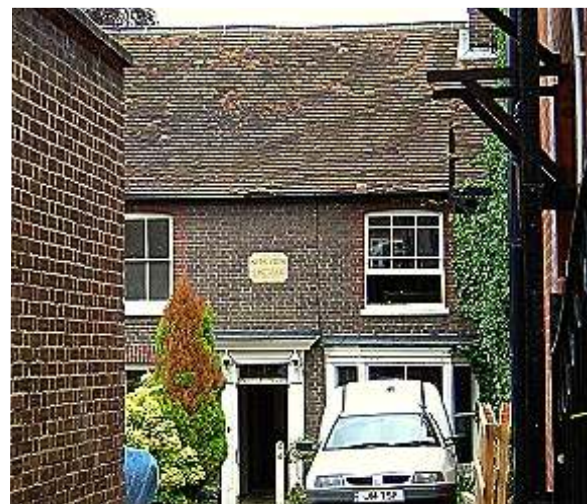
Park View Cottage, High Street

Park View Cottage is a detached house situated to the rear of 212 & 214 High Street. Mid to late C19th with C20th additions at rear. Two storeys. Clay peg-tiled roof with slate ridge and unrendered stacks to each end of front range with circular pots. Cast iron guttering and downpipe at left side. Unrendered grey brick with red brick dressings to lintels and quoins of the window openings, the quoins linked between the lower and upper storey. Original window openings have slightly cambered arches. Principal room to each side of central entrance hall with parallel service wing projecting to rear left side. Originally probably symmetrical façade with 3-over-3 paned sash to each side of central stone plaque inscribed 'Park View Cottage' to upper storey. Ground floor has similar