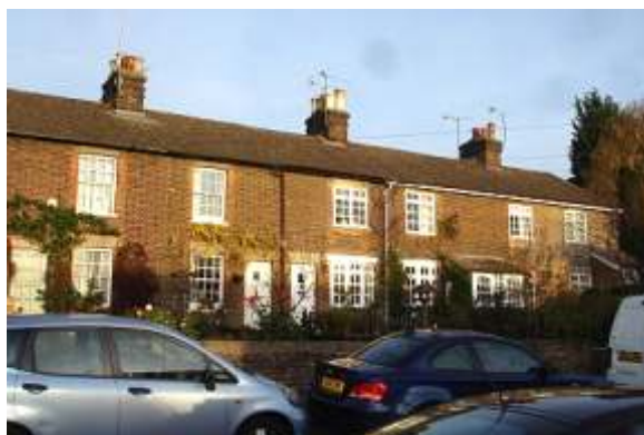
1, 3, 5, 7, 9 & 11 George Street

Nos. 1,3,5,7,9 & 11 form a terrace of six houses. Probably mid C19th. Two storeys. Shallow pitched C20th roof with gable ends. Three unrendered brick ridge stacks with assortment of stacks. Unrendered purple/grey bricks with red brick dressings to the openings. Stone wedge lintels. Each house is single room wide, direct entry plan. All originally had 8-over-8 paned sash on each floor to right of door. Nos. 1 & 3 retain sashes, C20th door to No. 1, plank door to No. 3 with small glazed panel. No. 5 has C20th windows. 2-light casement, 9 panes per light with 3 paned toplight above bowed window with 8 panes to each of the 3-lights. Plank door with small glazed panel. No. 7 has C20th windows, 2-light casement, 6 panes per light with 2-paned toplights, over bowed window with 8 panes to each of the 3-lights. Lean-to porch shared with No. 9; 'Stable' door has 3 panels to base and 9 paned toplight; No. 9 has door with 2 panels to the base and 12 panes to upper half, each door has 8-paned sidelight to left side. No. 9 & 11 have 2-light casement, 6 panes per light and 2-paned toplights on each floor. No. 11 has C20th lean-to porch with glazed door with 15 panes.