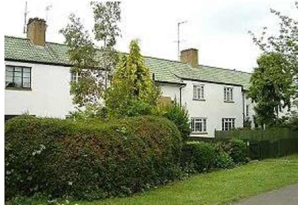
1, 2, 3, 4, 5 & 6 Londrina Terrace

Much of the fenestration has been replaced but all openings to the front retain their original sizes. No. 1 retains original fenestration with black painted Crittall frames. Vertical single-light 4-paned window to stairs to left of 3 light window, 4 panes per light over 4-light window also 4 panes per light. Original door at left end with three-quarter height triple panels to base and 6 paned glazed upper quarter. Bracketed flat-roofed canopy with ogee cornice. No 6 mirrors No. 1 and although fenestration has been replaced, the pattern of lights is to the original design. Nos. 2 and 3 and Nos. 4 & 5 form mirrored pairs, and each have expressed brick panels framing the pair of doorways. All retain their porch canopies. The fenestration is distributed similarly to No. 1 except that there is an