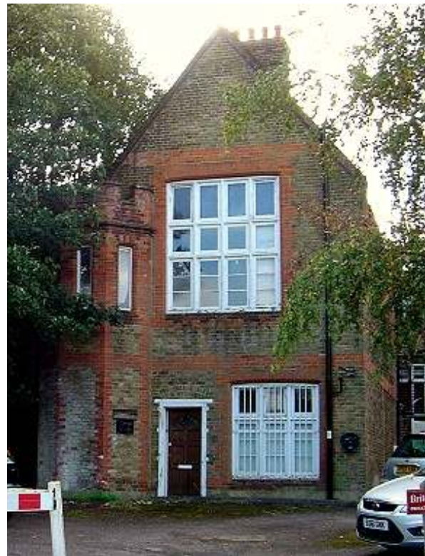
Tower House, Lower Kings Road

The Tower House has important historical associations having formed part of the fabric of the original Girls School premises.