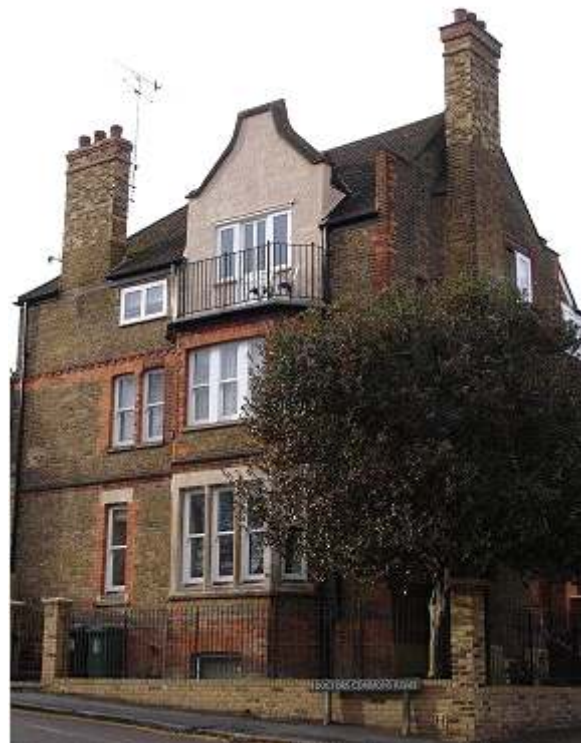
3 & 5 Charles Street (Egerton House)

over-1 sashes to the cants and small tiled gable. Doctor's Commons Road elevation has canted bay window rising from the basement with triple 1-over-1 paned sashes to centre and 1-over-1 paned sashes to the cants through two floors then reducing to rendered Dutch style gable forming a balcony entrance with French window with sidelights and railed balcony. 2-light window over pair of 1-over 1 paned sashes over single 1-over-1 paned sash to left. Rear service wing of No 3 extended into L-shaped extension with gable end onto Doctor's Commons Road