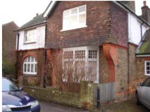
4 Station Road

No. 4 Station Road is a detached house. C.1905. Two storeys. Tiled roof with hipped end to left and front gable to right end with plain bargeboards. Swept finials to hip and front gable. Two brick stacks to left end and to right side in unrendered buff brick with circular pots. Downpipe with hopper at left end and downpipe to left of entrance. Painted render to upper storey, front projecting wing is tile-hung above the jetty. Unrendered buff brick to ground floor with red brick dressings to openings, 'jetty' detailing and moulded plat band. L-shaped plan echoing 'medieval' hall with 'jettied' cross-wing. Hipped roofed single storey garage attached to the outer flank wall of the jetty. All fenestration has cross-windows with smaller paned casements in the top lights. 3-light window with 12 panes above single panes above 4 light window with round-arched head, and smaller panes in the top lights filling the arch all to left of 2-light window over semi-circular arched doorway forming entrance to recessed porch which has tiled floor and 4-panelled door, the upper 2 panels glazed with plain overlight. Red brick front quoins to the cross-wing form elegant curving bracketed supports for the oversailing upper storey. 3-light cross-window with 12 paned top lights above single panes below, over canted bay window which has 15 paned toplights to the