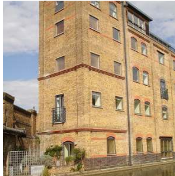
Castle Mill, Lower Kings Road

In addition to the conversion of the existing mill buildings, a block of three storeys with basement garage and attic storey with a curved roof has been added at the right end, with a glazed link across to the original building, and an additional storey with flat roof added to the four storey range. The rear of the building but now consists of 3 staggered blocks set diagonally to Lower Kings Road, the two original blocks with similar recessed panels, the third block being an added entrance/stair hall, with a single storey addition with gently curving roof in the angle (originally there was a