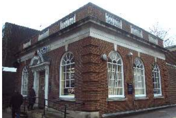
199 High Street (NatWest Bank)

No. 199 High Street is a purpose-built bank, early C20th, Classical style. Single storey. Flat roof concealed by parapet of brick but with panels of balustrading of 6 pillars and engaged half pillars at each end. Unrendered brick, chequered in red and purple bricks, with 'in and out' quoins in relief and window arches in red brick. Stone dressings to the plinth, keystones, entablature, doorway and parapet balustrades. Simple rectangular detached building, at right angles to the High Street, later C20th additions to rear. Symmetrical with tall semi-circular windows, one to each side of central door and three to each flank wall, splayed panes to the top, 9 panes to the upper three-quarters and single pane at base. Steps and later flanking ramps up to door, which has panelled reveals, moulded architrave and moulded pilasters, scrolled brackets at the head supporting cornice breaking forward with egg and dart moulding to the soffit and open swan neck pediment with foliated scrolls and pedestal base in centre. Timber door of 2 leaves, with 4 glazed panes per leaf; narrow overlight with criss-cross mouldings towards the outer edges.