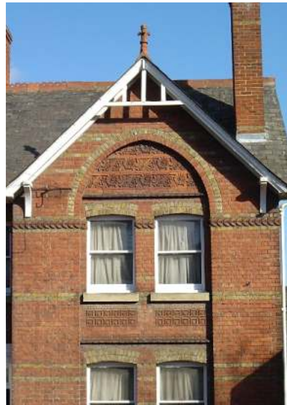
Use of polychrome brickwork and decorative moulded brick