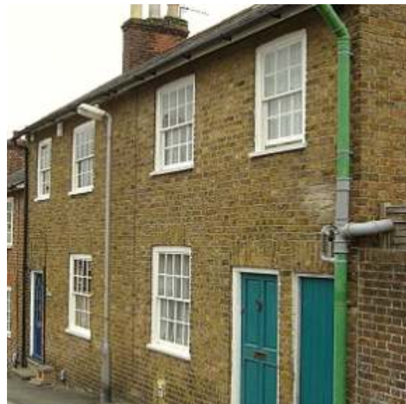
51 & 53 Highfield Road

Nos. 51 and 53 are a relatively unspoilt pair of houses and front directly onto the pavement of Highfield Road, which formerly led up to Highfield House, now demolished.