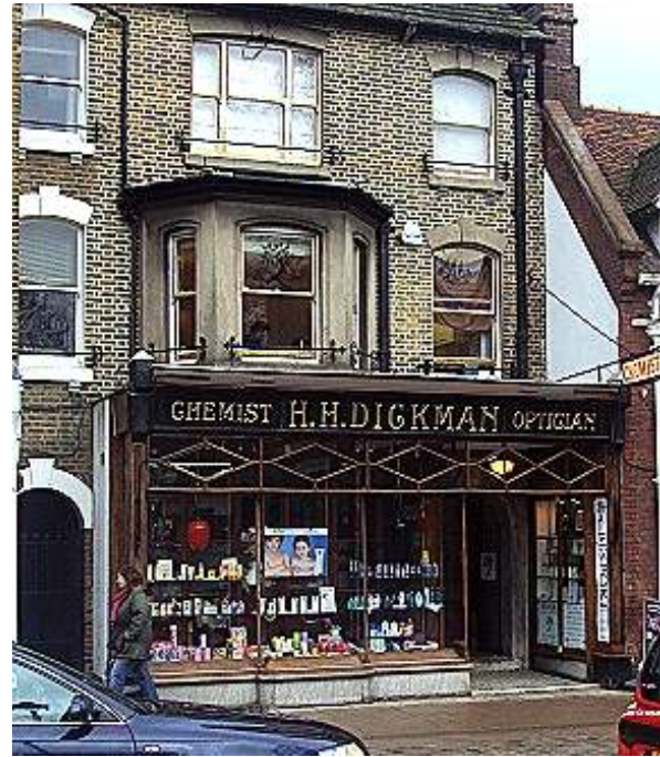
224 High Street

No. 224 High Street is a long-established retail premises with accommodation above. Mid C19th, possibly earlier fabric concealed. Three storeys. C20th tiled roof, gable to right end. Downpipe at right end with hopper. Buff brick ridge stack with circular pots. Unrendered buff brickwork and stone dressings to windows. Wide tripartite sash to upper storey over canted stone bay window, with window on each floor to right. All openings have cambered heads, 1-over-1 paned sashes and wrought iron window box rails with fleur-de-lis ends. Keystones and bracketed sills to all windows except the canted bay. Projecting ground floor shop window is rare survival. Canopy and fascia with early C20th lettering 'Chemist' to left and 'Optician' to right of H.H. Dickman. Bracketted ends and pilasters with lozenge design, repeated in the top lights to the shop window, divided by very thin columns into three large panes, the central bay breaking forward slightly, and wider fourth bay to entrance at right end. Marbled stall risers and chequered tiling to the entrance bay. Stone arched recessed door.