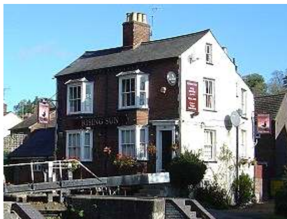
The Rising Sun PH

The Rising Sun PH is a purpose-built, canalside public house. C.1860's, possibly with earlier fabric concealed. Two storeys with attic storey and cellar. Slate roof with gable ends. Unrendered brick stack to centre with six circular ceramic pots. Downpipe to centre. Unrendered red brick with rendered gable ends, turning the corner to include the 'in and out' quoins. Two 2-storey canted bay windows with hipped slate roofs just below the eaves, all with 3-over-3 paned sashes with 1-over-1 paned sidelights except bottom left which has 6-over-6 paned sash. Steps up to door to right side with pilastered doors which have flush applied columns, plain entablature and cornice breaking forward. 4-panelled door.