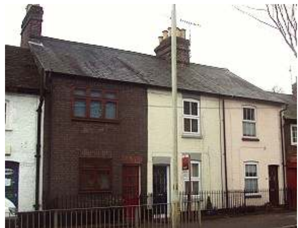
15, 17 & 19 High Street

Spear-headed railings to the front enclosures of each house.