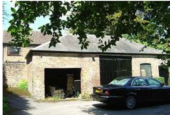
Former coach house to The Old Rectory

The coach house is a rare survival of an unconverted service building.