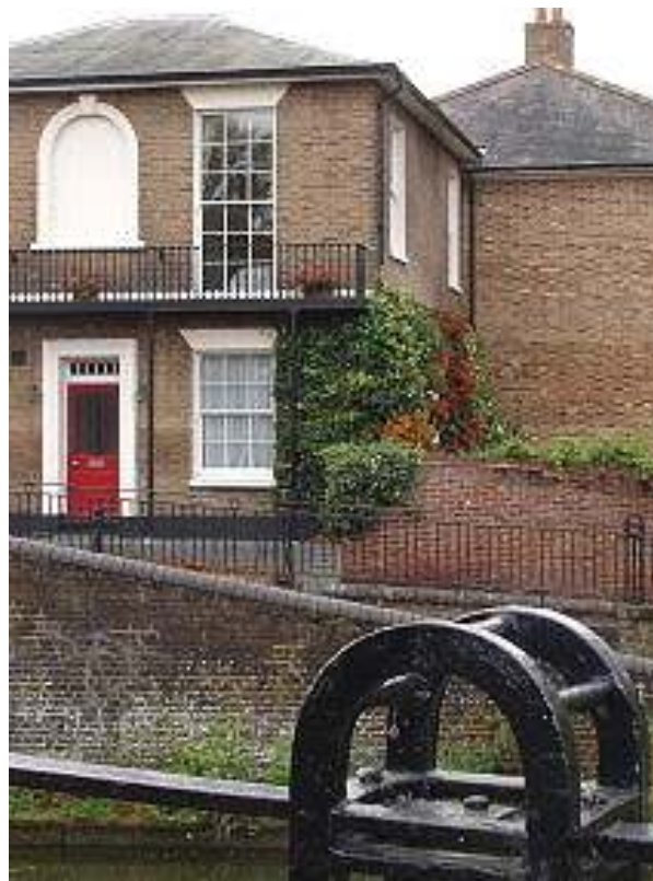
Robust ironwork and brickwork in the canal side setting