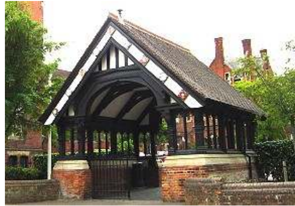
Lychgate, Berkhamsted School