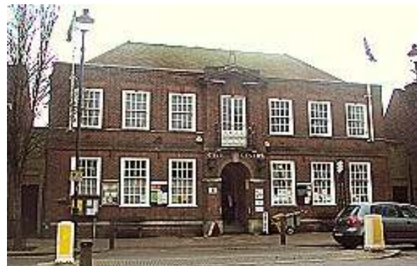
161 High Street (Civic Centre)

Purpose-built civic offices and former Police Court, 1938, now Civic Centre. Hipped clay tiled roof, partially hidden by parapet wall. Unrendered darker red and purple brick with narrow tile-on-edge to the flat window arches and inner arch of the semi-circular arched doorway and stone dressings to the central entrance, flanking plinths and forming continuous sill below upper floor windows. Nicely proportioned, symmetrical façade with blind brick panels to the parapet above 3 sashes on each floor above and below plat band; those to upper storey are 8-over-8 paned sashes, those to ground floor are 8-over-12 paned sashes. The arches to the upper floor windows have Modernist motif tile-on-edge keystones as does the entrance door, the latter in stone. Shallow projecting central bay has open stone pediment built into stepped parapet. On piers flanking narrow double doors at first floor level with 8 panes each to the glazed upper part, giving access to shallow stone balcony with wrought iron railings. Semi-circular arched entrance has stone plinth and imposts. Pair of iron gates fixed to inner face and 5 stone steps leading up to inner doorway. Lanterns to each side of arch, that to left retains blue glass with white 'Police' lettering. Plinth stones to each side of doorway, that to left inscribed 'Erected by the Berkhamsted U.D.C