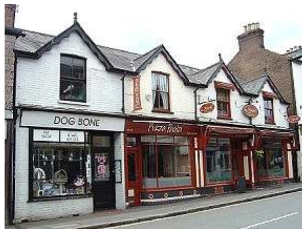
21, 23, 25 & 27 Lower Kings Road

Nos. 21, 23, 25 & 27 Lower Kings Road forms a terrace of retail premises, originally consisting of 2 pairs of units but the right hand two units have been thrown into one to form a restaurant, all with accommodation over. Late C19th. Two storeys. Slate roof with tall brick stack with pot at left end. Each single bay unit has large upper floor window, all 2-over-2 paned sashes, expressed as slightly raised gable with shaped bargeboards and all with finials (except No. 25). Painted brick and timber shop fronts. The largely original shop fronts are mirrored pairs, each with large paned window with 2 paned top light, curving in to recessed half glazed door with panelled base, glazed toplight and panelled reveal. Twin fluted pilasters between Nos. 25 and 27 and at each end of No. 23, that to right end is wider. No. 27 stall riser changed from timber panel to brick.