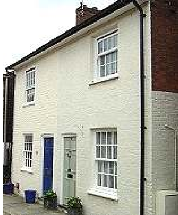
29 & 30 Bridge Street

Bridge Street is a good example of well-preserved modest and relatively uniform housing on both sides of the street, with subtle variations in the groupings of two to seven houses; these all front directly onto the pavement (which retains its original kerbing) and have uncluttered facades and simple roof profiles unencumbered with rooflights or dormers.