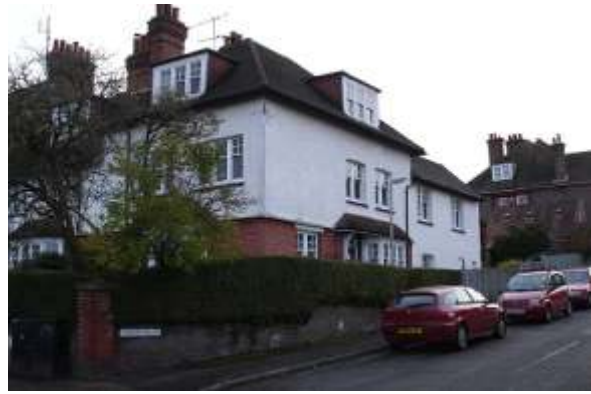
37 North Road

No. 37 North Road with No. 45 Charles Street is a house that turns the corner of North Road and Charles Street. Early C20th. Tiled roofs hipped to main range on the corner. Downpipe to right end of North Road elevation and towards left end of Charles Street elevation. Unrendered brick stack at left end of Charles Street elevation and to ridge of No 45. Flat-roofed 3-light dormer to each elevation of No. 37 and to No. 45. Upper storeys are painted roughcast render, lower storeys of unrendered red brick. Two storeys with attic storey. No. 37 has room to each side of entrance on North Road elevation, with lower service range extending southwards up North Road. No. 45 has entrance hall to left of principal room. Alleyway between Nos. 37 and No. 45 on Charles Street. All windows have 4 paned upper sashes, single pane to lower sashes. North Road elevation has two twin sashes over tiled hipped porch supported by shaped timber brackets and extending over canted bay window to right with triple sash to centre and single sashes to the cants. Steps up to 5-panelled door, the upper panel glazed, with glazed overlight. Twin sash to left with timber lintel. Similar fenestration to service range to right. Near symmetrical elevation to Charles Street with two triple sashes over canted bay window with hipped roof, triple sash to centre and single