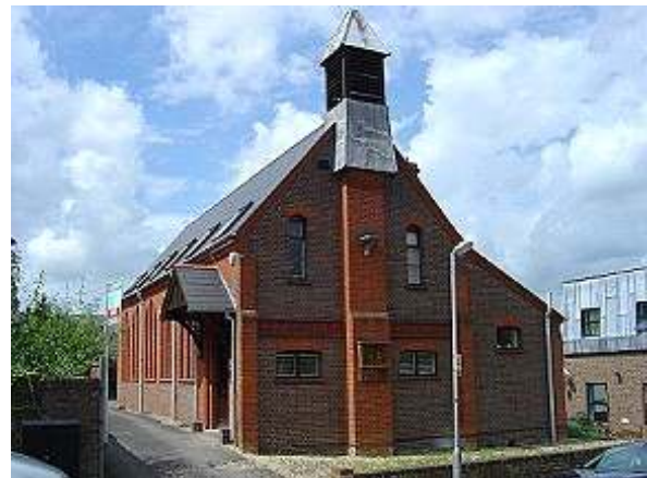
1 Park View Road (The Chapel)

Gable to street has prominent central brick shaft buttress with offset, bracketed timber base for statue and corbelled support for projecting louved timber bellcote with lead sheathed pointed cap and apron. Outer buttresses flank narrow 3-light window, 3 panes per light, with pointed arch above horizontal 2 paned window with cambered arch each side of shaft and with moulded roundel tiles to plat band in darker red clay in between. The roof is cranked to the north side aisle with single paned window and cambered arch. South flank wall has 5 tall 3-centred arched windows with chamfered brick mullions. Gabled slate porch canopy supported on timber brackets to first bay with door of two panelled leaves, the upper panels glazed.