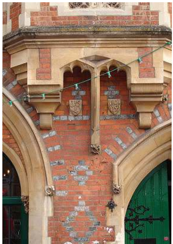
Highly decorative stone and brick work