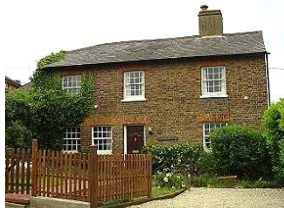
58 Highfield Road (Chaffcutters)

No. 58 Highfield Road stands apart and is set back from the mainly terraced housing in the street, with a picket fence to the front. Situated close to the top of the road, it was located immediately adjacent to Highfield House, now demolished.