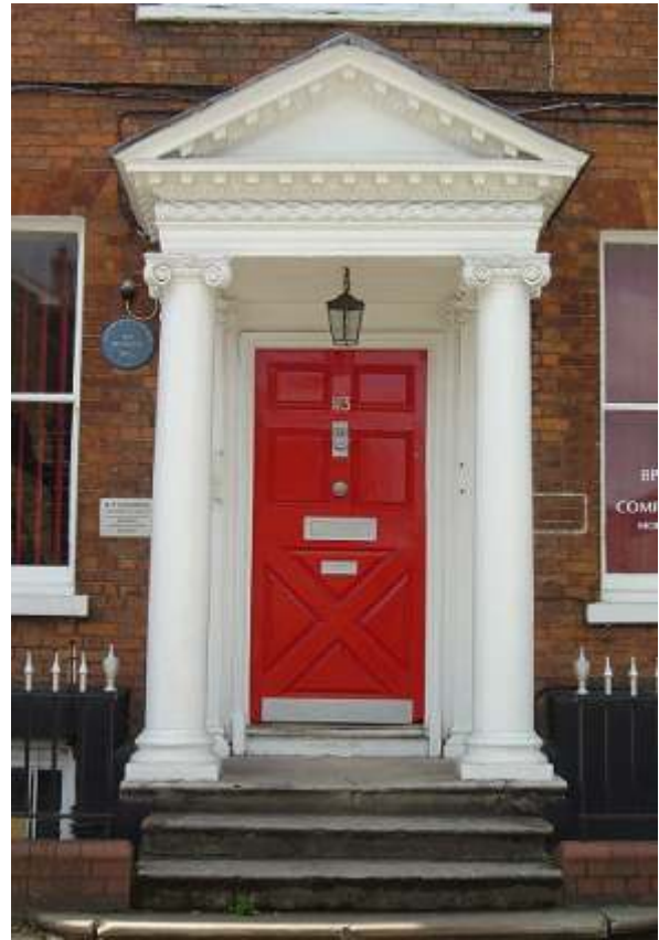
Columnated classical doorways on the High Street