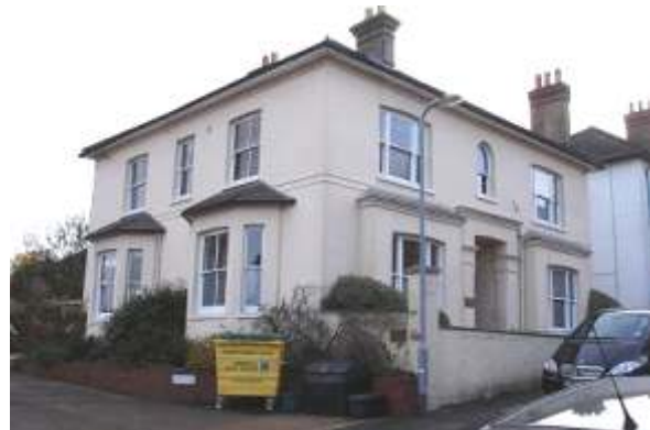
1 Boxwell Road

No.1 Boxwell Road is a detached house, now used as doctor's surgery. Late C19th. Hipped slate roof with boxed eaves. Unrendered brick ridge stack. No downpipes to main elevation. Painted rendered brick. Square on plan, double-fronted house with central entrance hall facing road and further elevation looking north. Symmetrical arrangement, all openings with slightly cambered heads except for narrow semi-circular arched window 1-over-1 paned sash to centre. Tripartite sashes each side with central and side lights of 1-over-1 panes over shallow projecting single storey bays with hipped roofs, moulded cornices and similar tripartite sashes. Central shallow projecting porch with heavy engaged pillars with chamfered piers and moulded capitals supporting plain entablature with cornice breaking forward in same style as bay windows. Recessed 4-panelled door and overlight with 'Surgery' in gold lettering. North elevation has 3-window range of 2-over-2 paned sashes over pair of single storey canted bay windows with 2-over-2 paned