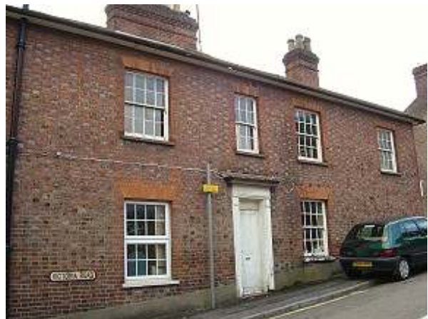
1 Victoria Road

Cast iron sign with Victoria Road road name to left of ground floor left hand window.