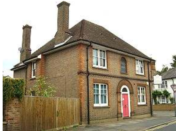
Brownlow House, Ravens Lane

Side elevation to Chapel Street has panel in centre cutting through the plat band with moulded brick s