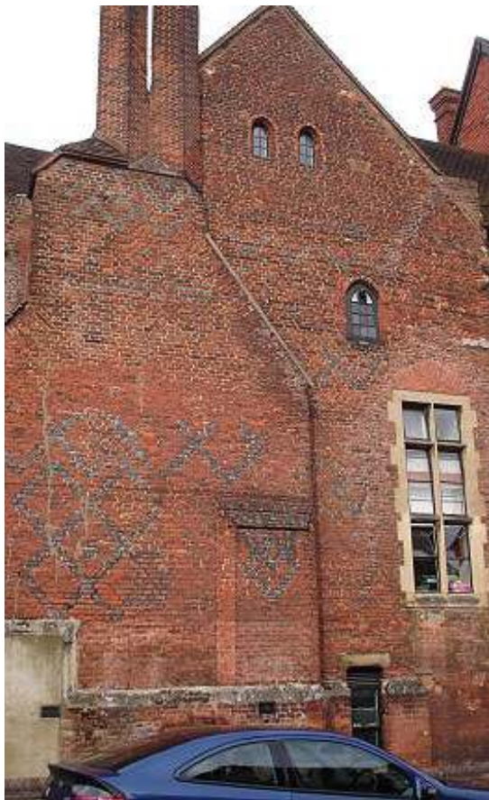
Ancient brick gable wall and massive chimney base