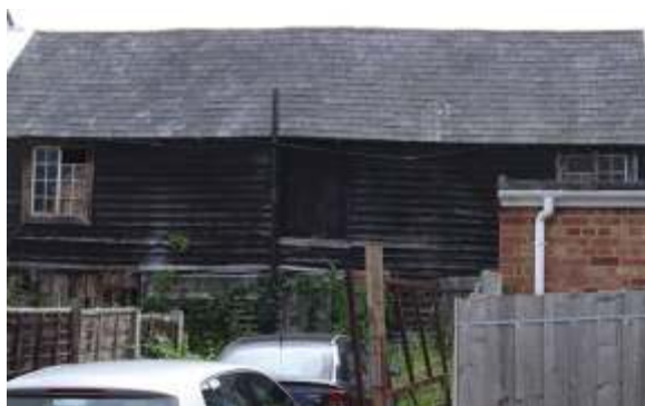
Building to the rear of 50/52 Charles Street

A rare surviving detached workshop building in an otherwise residential area.