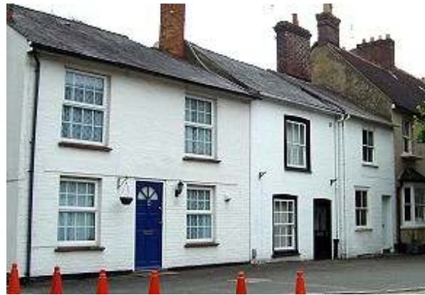
29, 30 & 31 Castle Street

No. 31 is double fronted house, near symmetrical layout with two 8-over-8 paned sashes over similar sashes flanking 6 panelled door incorporating top 'fanlight'. Openings have flat arches apart from top right window which is slightly cambered. Right hand windows are set in from left wall indicating presence of large chimneybreast, although the door and right hand window have replaced former integral door and shop window. Downpipe to left hand end. Left gable end has slightly projecting stack and irregular C20th fenestration of 4 windows and door to rear half of gable.