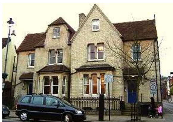
131 & 133 High Street

Above these, each wing has paired sashes to the first floor and single window to the attic storey. The paired and triple sash windows are set in chamfered reveals with chamfered stone sills and lintels, the latter carried down to form moulded impostes and divided by colonettes with foliated capitals. Pointed relieving arches to the upper floor windows of the wings. The wings are flanked by entrance bays, each with a single light window over 4-panelled door, the upper two panels glazed with overlight, under a tiled lean-to canopy supported on the outer edge by shaped timber brackets. All sashes are 1-over-1 panes except the attic storey windows which are 2-over-2 panes. Ornamental iron railings on low stone walls to front and stone steps up to front doors.