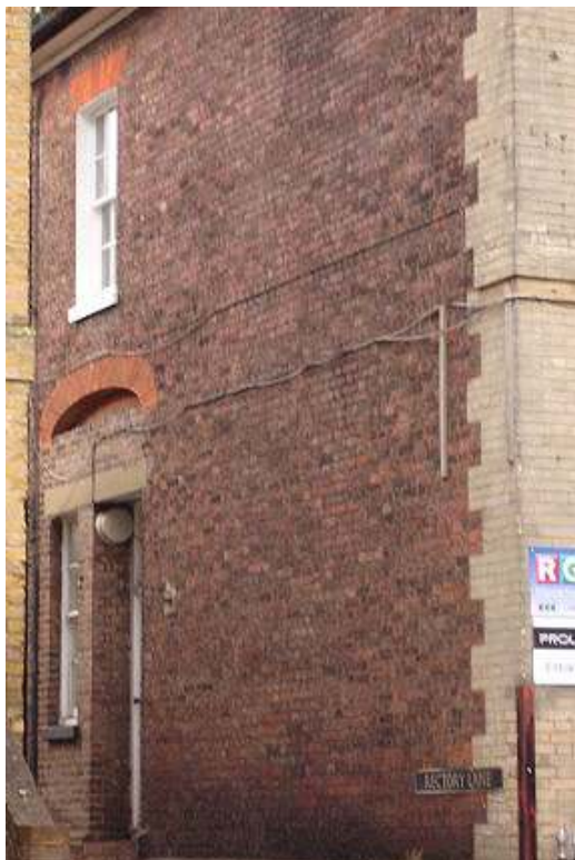
Flank wall in Luton Greys with soft red brick arches