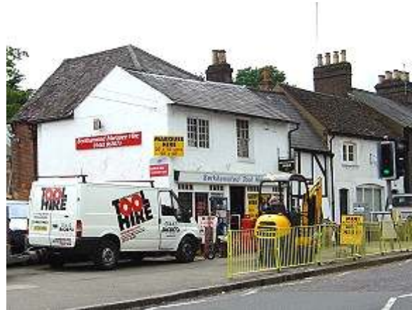
9, 11 & 13 High Street

No.11 is part of a terrace formed of a varied group of modest housing mixed with retail or former retail use, in a sensitive and prominent position at the eastern gateway to the Conservation Area.