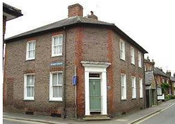
4 Chapel Street (Bridge House)

A traditional blue enamel road sign for Bridge Street is fixed to the wall above the southernmost window of the Bridge Street elevation.