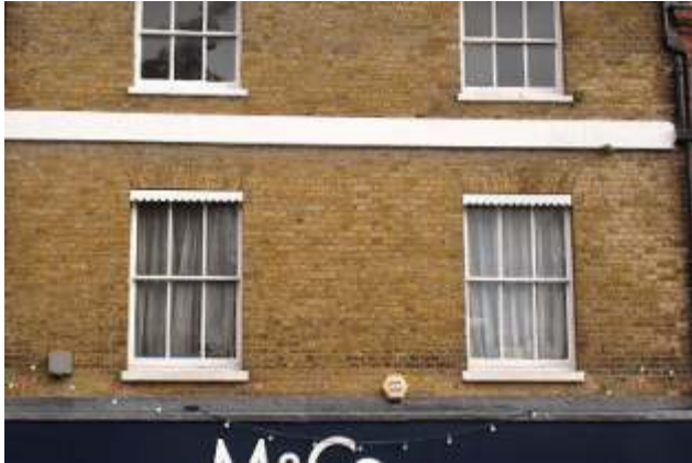
Yellow stock brick facade