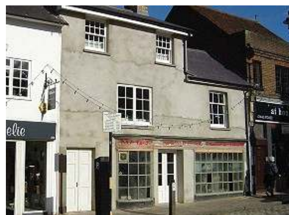
262 High Street

Continuous narrow fascia across whole façade, moulded top and bottom. Full storey height bowed window with 20 large panes and 32 paned flush window to right of entrance with door of two leaves, 3 panes over panelled base to each leaf. Each window flanked by thin pilasters. Door of two leaves at left end, 3 panels per leaf.