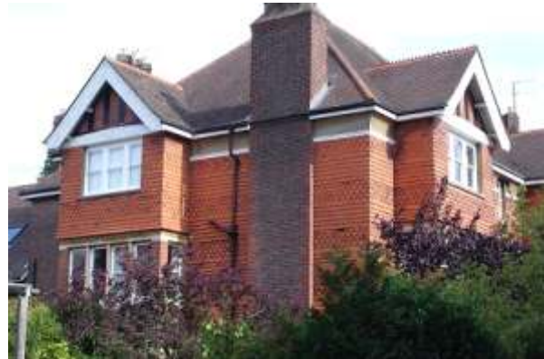
Angleside House, Doctor's Commons Road

Pair of large semi-detached villas. Late C19th. Hipped tiled roof with patterned ridge tiles. Rendered coving above white moulded timber cornice. Stacks at each end, the main shafts reducing to diagonally set triple shafts above the moulded caps. Overhanging gables of bays have painted bargeboards and false timber framing with patterned upright and on edge brickwork infilling with cranked crenelated collar. Tile-hanging to first (excepting bays) and second storeys incorporating 4 bands of scalloped tiles. Stone dressings to ground and first floor windows and to pier and impost banding to entrance doorways. Ground floor has purple brick with red brick dressings, including moulded brick plat band below the tile-hanging and across the bays. Three storeys. Mirror pair of villas with principal room outside adjacent entrance halls. Symmetrical facades, each villa with square projecting bay rising through 3-storeys. All sashes are 1-over-1 panes. Triple sash to top floor, quadruple sash to first floor, and cross-window with chamfered mullions to ground floor, both with full-width stone lintels. Elegant adjacent semi-circular arched outer doors with moulded brick outer edge and rounded soffits, both arches framed in an outer square headed