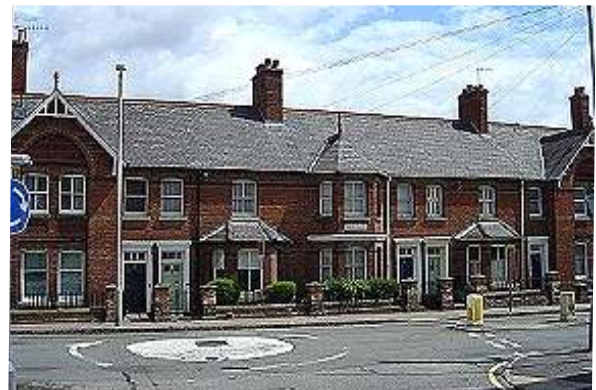
66, 68, 70, 72 & 74 High Street (Sibdon Place)

Nos. 66, 68, 70, 72 and 74 form a long, integral terraced range of two storey houses collectively called Sibdon Place. Architect-designed, c. 1860s. Slate roof with gable ends, projecting at right end with shaped brackets at eaves level. Downpipes to right of central bay and right side bay. Brick stacks, to the ridge and two taller shafts set forward from the ridge at each end, that to left end has tall circular clay pot. Unrendered deep red brickwork with buff brick and some stone dressings.