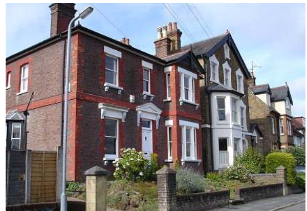
39, 41, 43 & 45 Charles Street

No. 39 Charles Street is a detached house. Late C19th. Hipped slate roof with boxed eaves and gabled bay with timber-framed truss with raking struts and spike finial. Axial stack to left hip and two stacks to right end, all with assorted pots. Downpipe near to right end. Purple bricks with colourwashed brick dressings to the windows, quoins and plat band which continues round left flank wall. 'In and out' work using 4 courses except on bay where the quoins are toothed. Painted stone lintels and bracketed sills to windows and porch. Two storeys. Double-fronted with principal room to each side of entrance hall. 1-over-1 paned sash over door with pedimented cornice supported on scrolled brackets; stone steps up to 4-panelled door with plain overlight. 1-over-1 paned sash over similar window with flat cornice breaking forward and supported on scrolled brackets to left. Two-storey projecting bay rising through 2 full storeys with tripartite window on each floor with 1-over-1 paned centre and side sashes, and additional 1-over-1 paned sashes in the returns to right. Single storey bay window with hipped to roof to left flank wall.