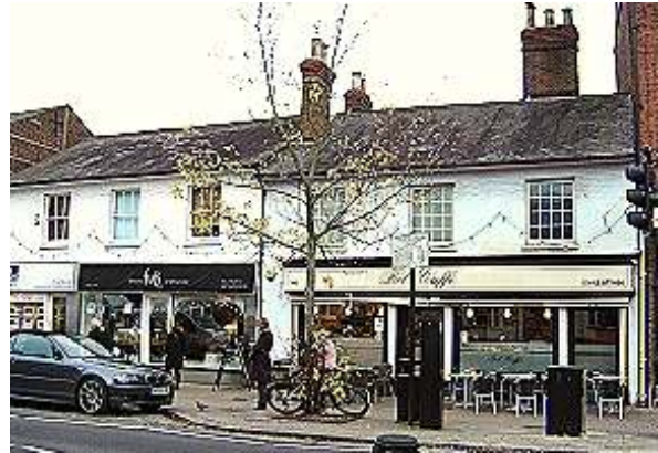
146, 148 & 150 High Street

No. 146 High Street is a low, two storey retail premises with accommodation above. C19th but possibly with earlier fabric concealed. Slate roof, tall axial stack to right end and stack set forward of the ridge at left end. Painted brick, double fronted timber shop front. Range runs parallel with the High Street and extends back to Church Lane at the rear. 3 window range of C20th 16 paned tilting sashes above 19th shopfront with fascia and moulded cornice and fluted pilasters. Single large paned window to left and wider window divided into two sections to right of glazed door.