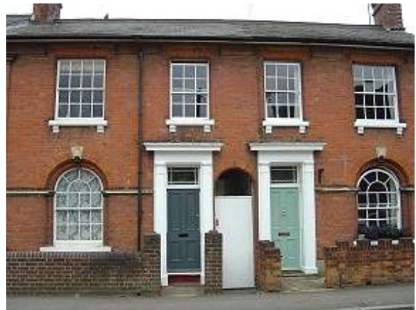
15 & 16 Chapel Street

Single room wide with entrance halls flanking a narrow central alley with semi-circular arched opening with quarter-round moulded brick architrave. Each house has 8-over-8 paned window outside 6-over-6 paned sash to upper storey. Sills are supported on moulded brackets. Ground floor has elegant semi-circular arched window with timber sash, 8 panes to the lower panes, recessed into double semi-circular arched opening, with moulded stone keystones and quarter round mouldings to both the inner and outer arches. Entrances have doorcases with panelled reveals, shallow engaged fluted columns, shallow cornices to the entablatures. Both No. 15 & 16 have 4-panelled doors with rectangular overlights (No. 16 with etched glass) with margin glazing bars.