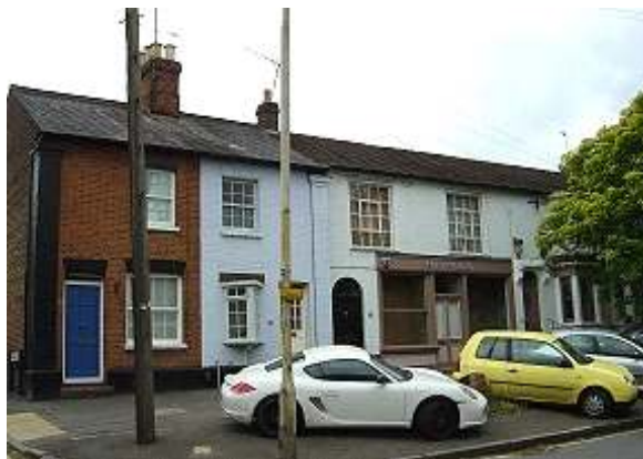
55, 57 & 59 High Street

No. 59 High Street is a mid to late C19th house and retail premises. C20th tiled roof, with downpipe at left