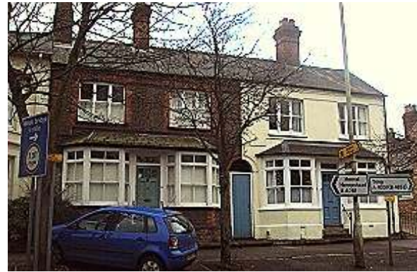
73 & 75 High Street

Three stone steps up to door with elegant handrails and end posts with octagonal shafts and finials to each pair of steps. No. 73 also retains single baluster with ornamental wrought iron decoration on each side of middle step. Two 4-panelled doors with three glazed panes at the top. Plain overlight.