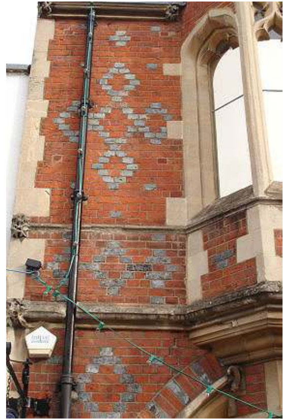
Stone window frames and dressings with burnt header, diaper pattern brickwork