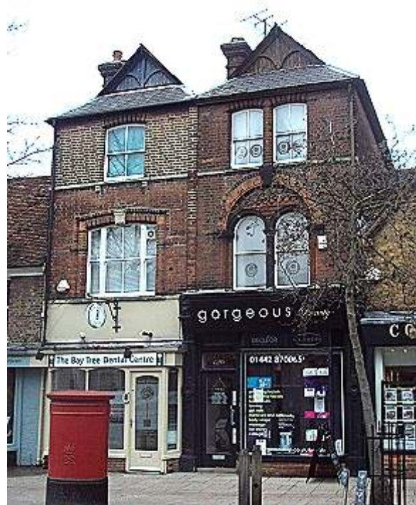
126 & 128 High Street

No. 128 has single central 2-over-2 paned sash over similar impost band across the façade but bracketed below the window to top storey. First floor has less flamboyant treatment to its neighbour, with a tripartite sash 2-over-2 panes with 1-over-1 paned sidelights, with projecting brick architrave which has cambered arch and outer label mould with returned ends. Deep fascia above projecting cornice with narrow fascia over canted shopfront with window