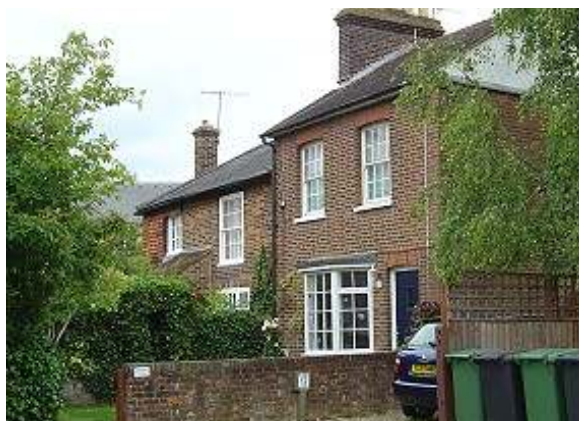
35 & 36 Castle Street

No. 36 has 2-light, 6 panes per light Yorkshire sliding sash to left and 6-over-6 paned sash to right to upper floor. Lean-to brick porch with clay tiled roof to plain painted 6 panelled door. Small 4-paned window to left,