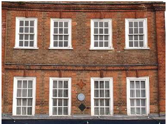
Classical façade with brick band and cornice and pilasters