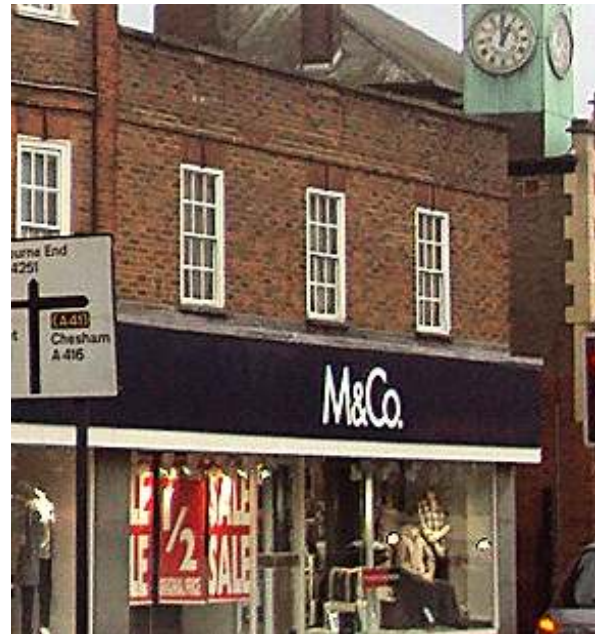
212 & 214 High Street

Timber framing in retained rear range. H.C Ward & Son occupied the property in C19th and early C20th, later Sharlands, now M & Co. Fronts directly onto the pavement. Wide alley to right gives access to Park View Cottage (q.v).