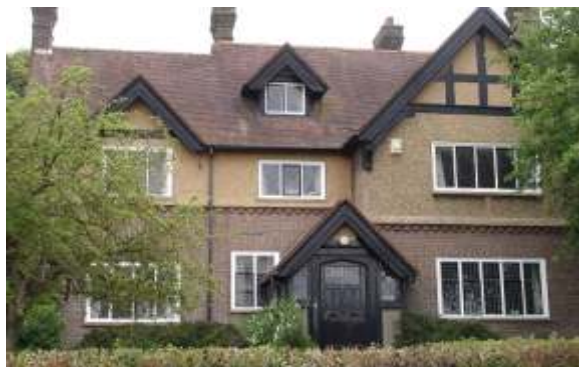
9 Shrublands Road (Stonycroft)