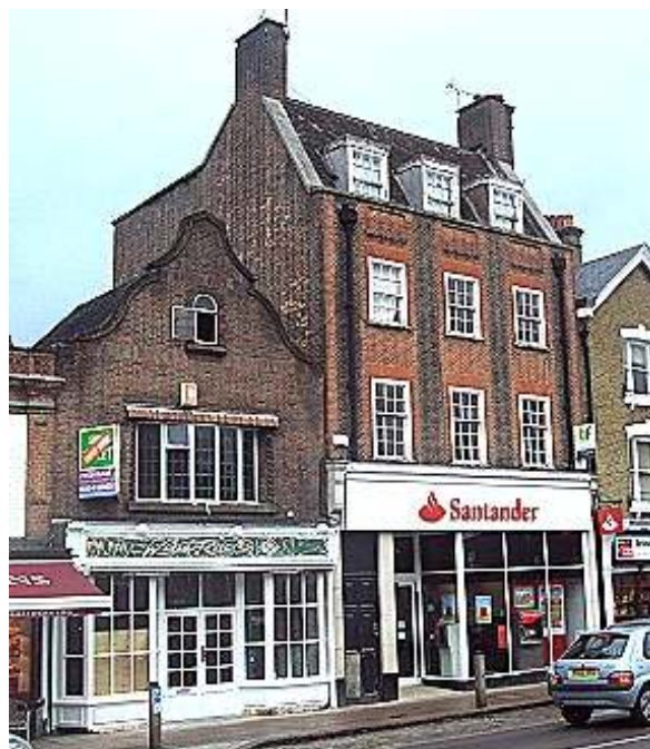
230 & 232 High Street

Retail premises with accommodation above. Tall 3 storeys with attic storey. C.1910 in Queen Anne style. Clay tile roof with stone coped raised gables and coped parapet. Tall unrendered brick stack at each side. 3 flat-roofed attic dormers with 6 over 6 paned sashes. Three blind panels to the parapet, Unrendered brick to front in red brick, the bays divided bay by vertical bands of darker brick, and rubbed brick dressings. Downpipes towards each side. Timber shop front. Symmetrical 3 window range with range built parallel with the street, upper floor windows with 6-over-6 paned sashes, first floor with 6-over-9 paned sashes. C20th full width shop front with end pilasters with fluted stone frieze below shaped brackets. Deep fascia of 3 paned window with toplights to right of recessed double doors with overlight and 6-panelled timber door at left end.