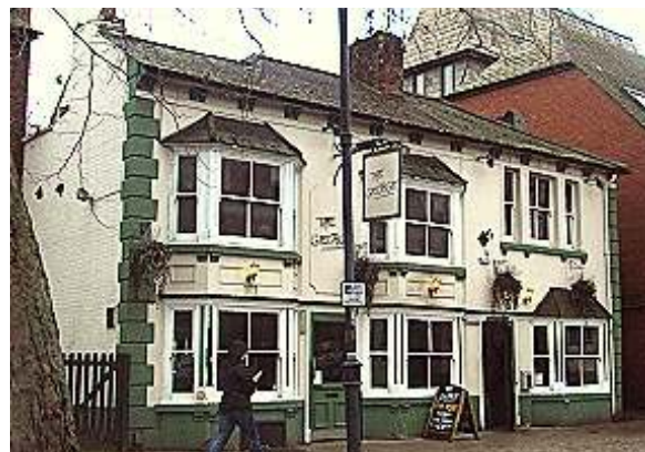
261 High Street (The George PH)

No. 261, High Street is a public house, late C19th but possibly with earlier fabric concealed. Two storeys. Slate roof, formerly hipped at both ends, extended as slightly lower gable ended roof to left end, all with overhanging eaves supported on pairs of shaped brackets at intervals above plain cornice that forms part of heads to right hand side windows. Unrendered brick ridge stack and rendered stacks at each end. Painted render with toothed rusticated quoins. All windows have bracketed sills. 3 canted bay windows, flanking entrances, the two to left are 2 storeys below the cornice; right end bay is single storey. All bay windows have hipped roofs and 2-over-2 panes to central sash and 1-over-1 paned sidelights, with troughs of the