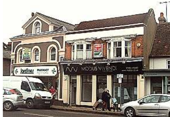
88 & 90 High Street (inc 90A & B)

Retail premises consisting of shop with offices over. C.1890s. Two storeys with attic. Built gable end to the High Street, turning corner with w. flank wall onto Manor Street. Slate roof, hipped to front end but with the ridge brought forward over wide attic dormer with stub piers to each side and moulded verges. No downpipes to main elevation. Rendered brick stack to left side with tall shaft (second paired stack now removed) Painted render with painted dressings. Shallow corner piers and central pier to flank wall breaking this elevation up into two panels. Plain