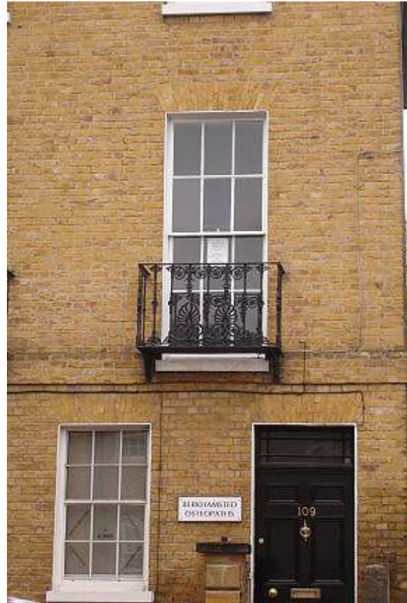
Splayed window arches in yellow stock façade