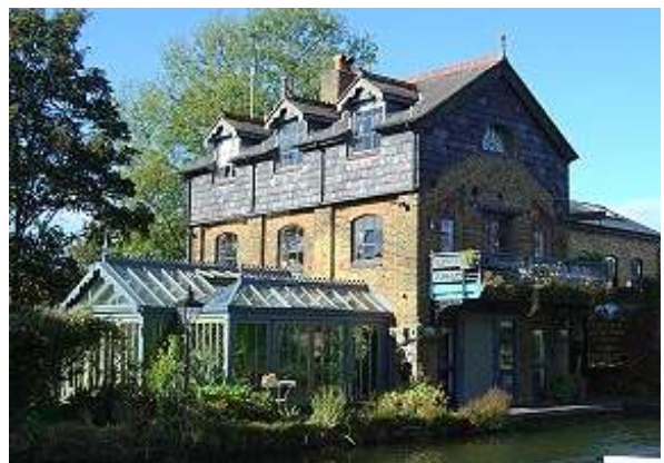
The Warehouse, Castle Wharf

Former warehouse now converted to residential use. Late C19th. Three storeys, the top storey added later. Slate roof with brick ridge stack. Bargeboards to front gable, crested tiles to main ridge and dormers and tall ball finials to front and rear gable and central dormer and swept finials to flanking dormer on left side. Slate hung top storey, unrendered buff brick with red brick dressings to the window arches and extending as short bands from the lintels and sills of the flank windows. Built at right angles to and set close to canal with loading doors to front and upper storey first floor. Front elevation has lunette window forming apex to sloping verge brickwork. Recessed brick panels with single light windows on each floor to each side of double doors on each floor, those to ground floor has large warehouse sliding door. Projecting first floor wrought iron balcony supported on wrought iron brackets. Gantry timber projecting above to right side. Side elevations have three half dormers on each side with cambered headed 9 paned lights and decorative bargeboards. Flank walls divided into 3 recessed window bays. Left flank has 3 similar windows to first floor – ground floor openings obscured by large timber and glazed conservatory projecting at right angles. Right flank has a similar window each side of loading door with double plank doors to centre. Similar window to front ground floor