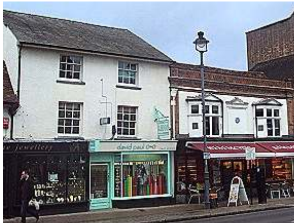
234 & 236 High Street

No. 234 High Street is a retail premises with accommodation on first floor. Low two storeys. Clay peg tile roof with gable end to right, abutting 236 to left end, partially concealed by low parapet with moulded capping above two courses of tiles moulded with 'X' motif. Downpipe with decorative fluted hopper at left end. Mainly painted brick to upper storey but with unrendered brick, moulded and dentilled frieze with piers at each end with blind panels. Canted bay window with two lights and single lights to the cants, all single pane with top light and pediment over the bay, each side of panel with entablature, the central section breaking forward as pediment. Shop front with two canted bay large paned windows each side of central glazed door.