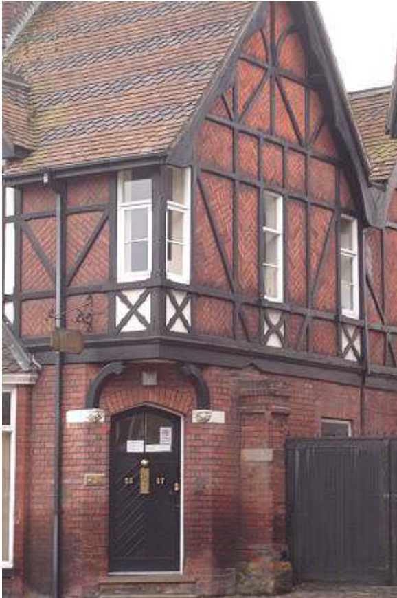
Elaborate & brick patterns within mock framing