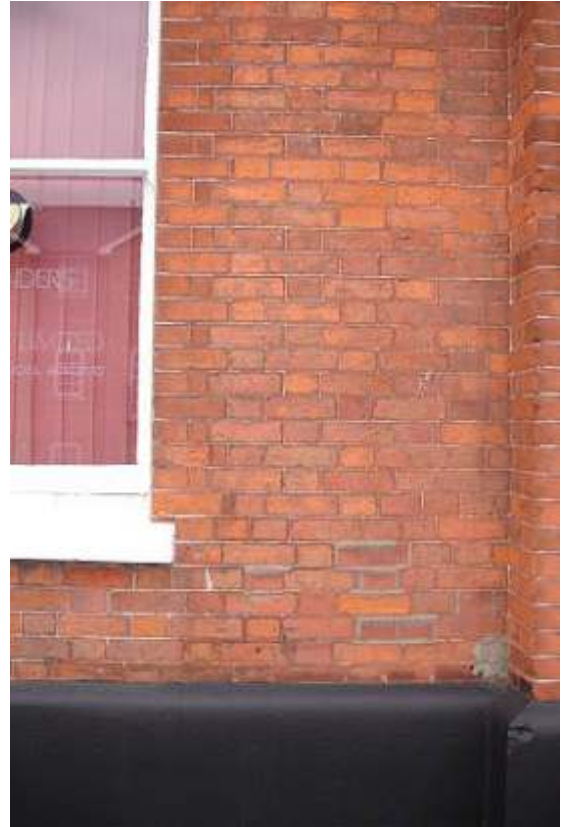
Red brick with coloured and tuck pointing