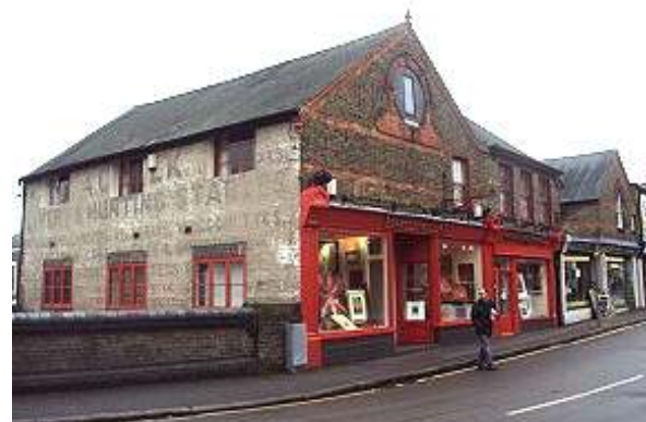
35, 37, 39, 41 & 43 Lower Kings Road

Large semi-circular arched window to centre of gable with outer moulding and raised keystone. 2-over-2 paned sash. Small 2-over-2 paned sash to right end. The shop fronts consist of long fascia across whole facade with bracketed ends and panelled pilasters at each end, between the shop fronts and at left end of right hand shop window. Each shop front consists of very large single pane canted in at right end to glazed