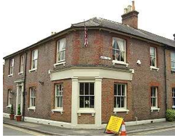
20 Chapel Street

Cast iron road sign for Manor Street fixed to upper storey above shop fascia.