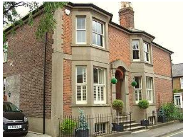
14 Manor Street (Belgrave House)

No. 14 Manor House (Belgrave House) is integral with No. 21 Chapel Street (q.v.). Late C19th. Two storeys with half basement storey, so that the entrance door, is raised and reached by flight of 3 stone steps to the recessed porch. Slate roof, hipped at left end with slightly projecting eaves. Unrendered red brick with painted quoins, plinth, projecting bays and door surround. The recessed door has semi-circular arch with applied columns and brackets supporting triangulated projecting canopy over the doorway with 3 circular motifs (echoing the motif to the doorway of No. 21 Chapel Street). The motif is repeated on the brackets. 4-panelled door flanked by two storey canted bay windows with hipped roofs, and single paned sashes to the cants each side of 2-over 2-paned sashes. Basement has 4 paned windows.