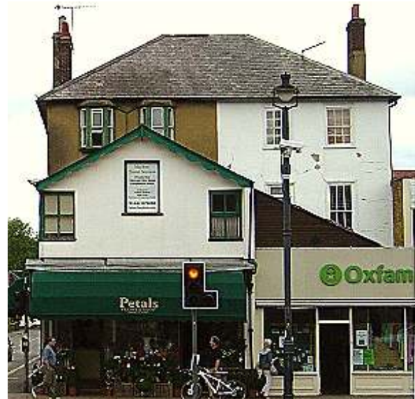
204 & 206 High Street

Right side shop projection has horizontal timber boarding to front end of monopitch roof, very deep fascia above shop front with single large pane to left and two large panes to right of doorway. Left side front gable has two 4-paned windows to each side of higher first floor window, the left side window continues round to Kings Road elevation as continuous row of seven 4-paned windows, each alternative window has upper half as opening toplight. Ground floor has large paned glazing to two elevations, with integral door with 2 paned overlight and step up to adjacent lower door at juncture with No. 1. Shopfront to 1 Lower Kings Road has pilasters