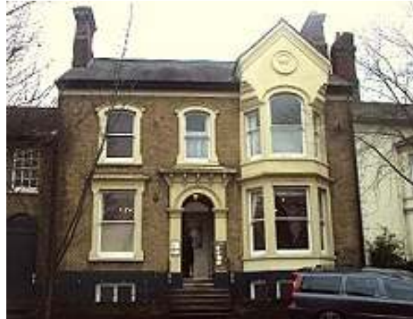
69 High Street

Flight of 5 steps up to porch, further 2 steps up to outer 4-panelled door with glazed fanlight with name 'Coleshill House' lettered to follow the arch and single