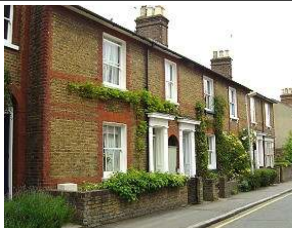
9, 10, 11 & 12 Chapel Street

Black and white road name 'Chapel Street' fixed at string course level in centre of terrace.