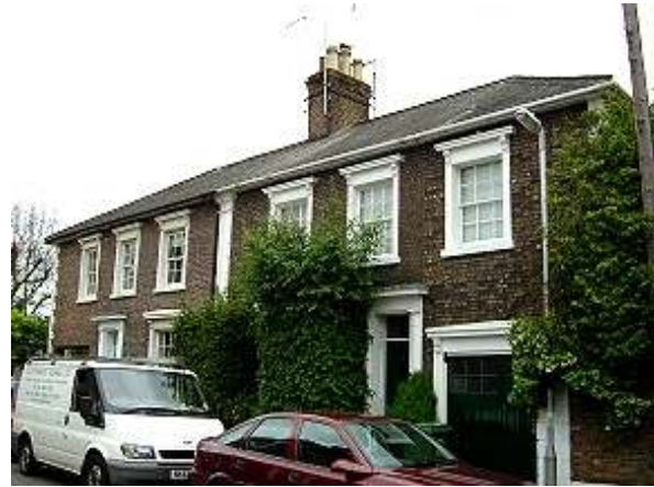
22 & 23 Chapel Street

Chapel Street is composed principally of elegant, modest late C19th semi-detached or terraced housing,