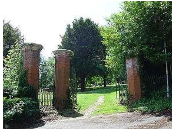
Cemetery piers and gates

Three tall finely jointed brick octagonal piers with moulded plinths and stone at the base, at mid-level to the rear faces and to the moulded cappings. 1842. Pedestrian gate to left and wider carriage entrance to right. Single gate to pedestrian gate, double gates to carriage entrance. Original gates were hung on pintles (which survive to pedestrian gate) on inner faces but now moved to lateral face for pedestrian gate and outer faces for carriage gates. Gates have mid-rail with alternating full-height and mid height barley-sugar twist uprights. Alternating scrolled and 'claw' heads to full uprights. All full uprights have alternate lower and upper tier with scrolled motif; each alternate uprights has upper and lower scrolled motif.