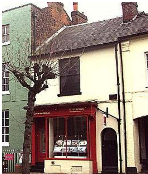
123 High Street

No. 123 High Street is a good example of a relatively unaltered, small shopfront.