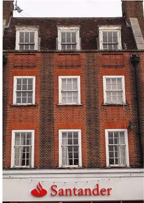
Parapet topped wall and contrasting "pilasters"