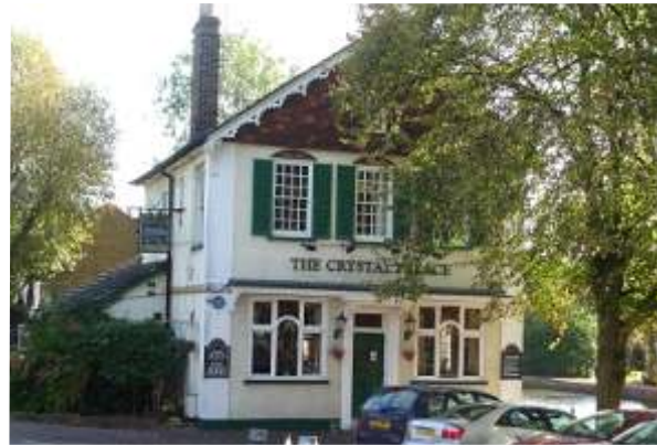
The Crystal Palace PH, Station Road

Blue Heritage Trail plaque to left side pilaster.