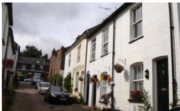
8, 9, 10 & 11 Middle Road

All openings have slightly cambered arches, except for alleyway which has semi-circular arched opening. Nos. 8 & 9 each have entrance door, that to No. 8 is 6-panelled, that to No. 9 is 4-panelled, outside single window on each floor, No. 8 has C20th 8-over-8 paned sashes, No 9 has C20th 12 paned window, the upper 3 lights being opening toplight, over 9 paned window with opening toplight. No. 10 has two 6-over-6 paned