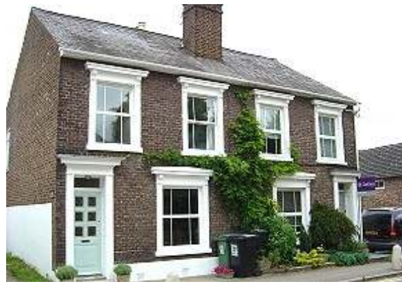
1 & 2 Chapel Street

Nos. 1 and 2 Chapel Street are a pair of two-storey semi-detached houses, c.1870's. Slate roof with gable ends and prominent central shared stack set forward off the ridge with 4 cylindrical pots. Half round guttering with single downpipe at right end. Dark plum unrendered brickwork. Single room wide and side entrance hall plan. Paired symmetrical frontages each with 2 windows over door outside single window. All windows have plain painted stone surrounds with bracketted hoods. 3-over-3 paned sashes (now with tilting upper lights). Shallow step up to pilastered doorcases incorporating flush fluted columns, panelled reveals and entablatures, the cornices breaking forward. Plain rectangular overlights with 6 glazed panes. Single panelled door to left and 6 panelled timber door to right. Left flank wall has single C20th window, right flank wall is blind, and has been painted. Dwarf brick wall with stone cappings to front.