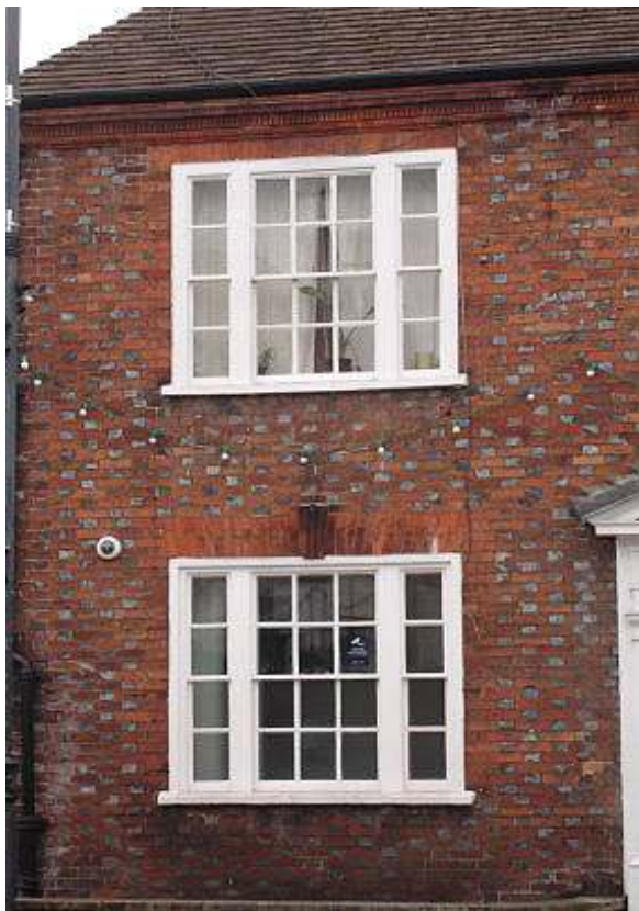
Burnt headers featuring strongly in red brick