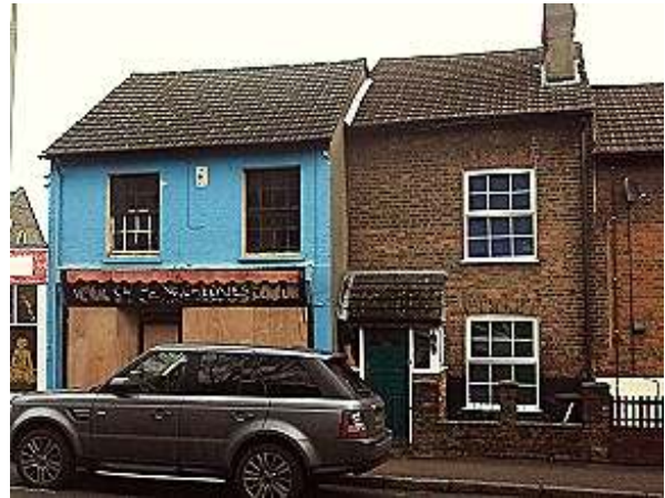
56 & 58 High Street

No. 56 High Street is a terraced two-storey house forming a row with No 52 and 54, but with slightly higher roof, to right and set back from No. 58 to left. C19th but possibly with some earlier fabric. C20th roof with brick stack set forward from the ridge at the right end. Downpipe also to right end. As with Nos. 52 & 54, No 56 has unrendered brick, changing from red/orange to darker brick above upper floor mid window height, suggesting the roof has been raised at some point. High rendered plinth. Single tilting sash, 6-over-6 panes on each floor with slightly cambered arched heads to right of lean-to entrance porch, brick to base, flanking and side lights and panelled door incorporation 'Georgian' fanlight, with machine-tiled roof C20th brick wall and railings to front.