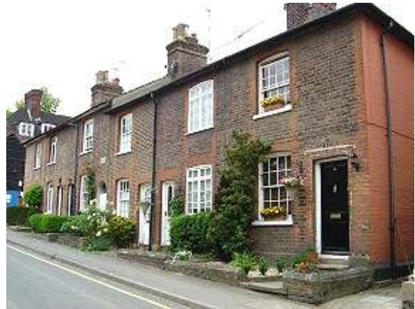
1, 2, 3, 4, 5 & 6 Manor Street

Plank door to right to alleyway with inset stone above inscribed 'Manor Cottages'. No. 4 has 8-over-8 paned sash to each floor to left of door, the lower half of 2 panels the upper part glazed and incorporating 'Georgian fanlight'. No 5 has timber door with 2 panels