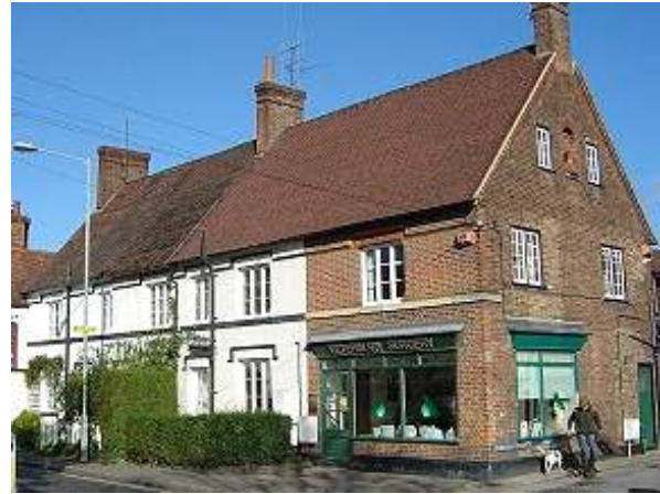
2, 4, 6 & 8 High Street

Nos. 6 & 8 to left side have symmetrical arrangement of outer 3-light windows on each floor each side of 2-light window above central open alley with semi-