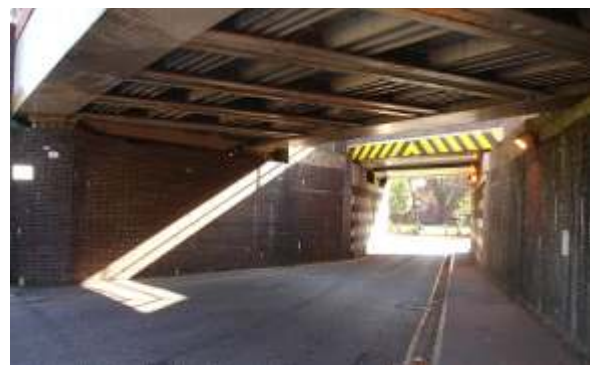
Railway Bridge near Berkhamsted Station

The construction of the Birmingham to London Railway began in 1834; the local contract was given to W. & L. Cubitt who employed 700 labourers at its peak of building works. It can be seen as having been partially mapped on the 1841 Tithe Map, not proceeding past Ravens Lane, through land owned by Lord Brownlow (Adelbert Egerton) of Ashridge (Map 4). The original E