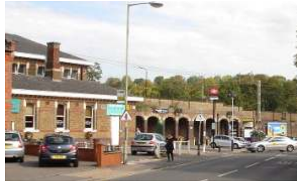
Berkhamsted Station and adjoining arcaded wall

The arcade consists of 13 arches running from the road bridge in behind the right hand wing. Segmental