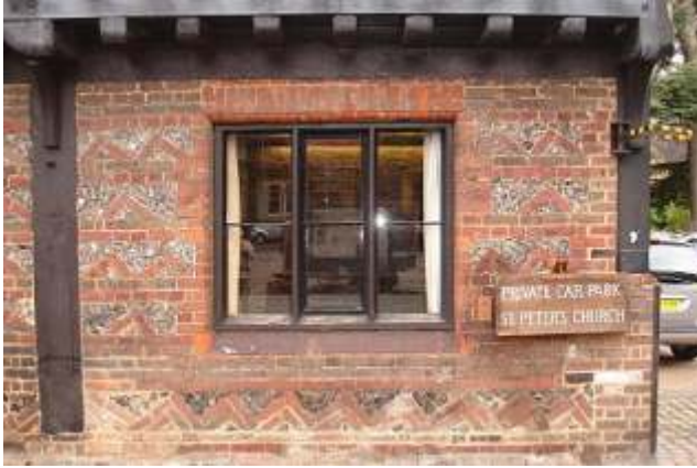
Unusual brick and flint work in a timber framed building