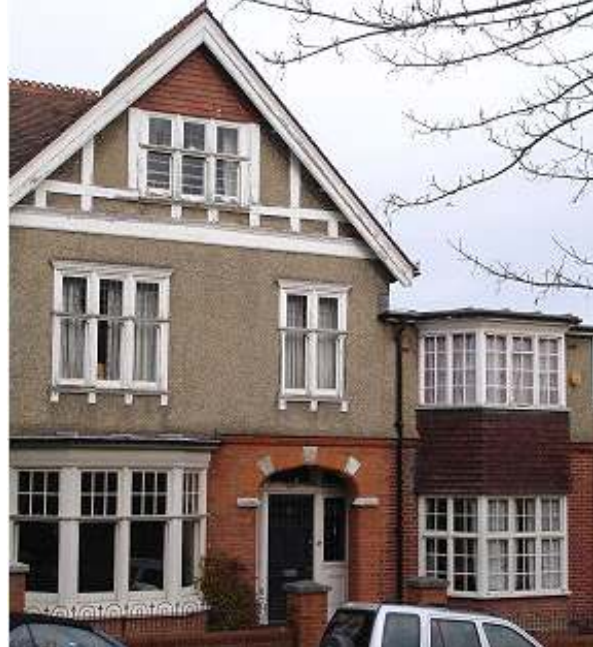
4 Charles Street

3-light cross-window in the large gable with 6 paned leaded light toplight with cross-rail at sill level and false studding beneath and to each side above false, slightly cranked tie with moulded upper edge. 3-light and 2-light cross-window to first floor with 16 paned top sashes and single pane lower sashes. Moulded timber cornices forming flat headed lintels. Shaped timber brackets below the sill inder each mullion and reveals. Moulded brick plat band between brick and first floor render. Flat-roofed canted bay window to left with two-light cross-window to centre and single light cross-window to the cants, all with 6 paned top sashes and single paned lower sashes. Three centred arched entrance with key stone, and flanking stones at the angles and moulded stone imposts, with roll moulded soffit and reveals. Recessed door has six panels, upper 2 panels glazed, with side panels, the upper half glazed and overlights. Two storey canted bay window