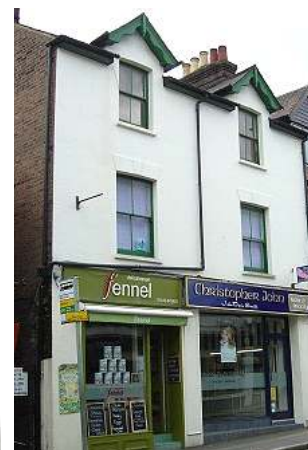
13 & 15 Lower Kings Road

Nos. 13 & 15 front directly onto the pavement and, as a C19th 3 storey pair of shops, occupy a prominent position on the east side of the road.