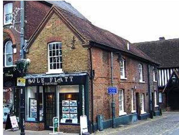
124 High Street

Front gable has 8-over-8 paned sash above fascia breaking forward over double fronted shop front with large glazed window, that to left side is narrower, each side glazed door. Brick to stall risers.