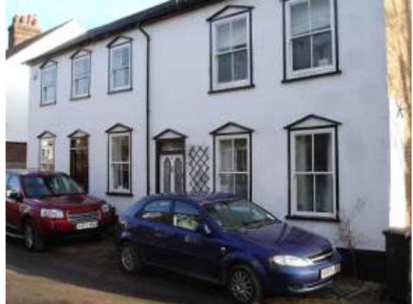
3 & 4 William Street

The houses front almost directly onto the pavement and occupy a sensitive position next to the canal. The pedimented and regular fenestration helps to unify the houses and the absence of other features creates a flush, uninterrupted façade.