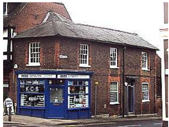
92 High Street

No. 92 High Street has shop to front part, turning the corner between the High Street and Manor Street, rear section formerly a house, now part of the shop premises, fronting on to Manor Street. Two storeys. Mid C19th, but with possibly earlier fabric concealed. Shopfront probably early C20th. Shop bay to front, former house with symmetrical arrangement of windows on each floor flanking door. Slate roof, hipped to front end. Downpipe to left of house door. Purple brick with red brick dressings, the toothed quoins being linked between the ground and first floor windows. Painted timber shopfront. Single sash to upper floor front, 3 sashes to side elevation, all 8-over-8 paned sashes. Sash windows to ground floor replaced with 1-over-1 pane windows each side of doorcase with thin pilasters and shaped brackets supporting shallow canopy. Stone step up to 4-panelled door incorporating 'Georgian' fanlight. Shop window has slender fascia over wide half-glazed door