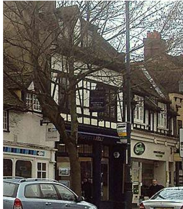
167, 169 & 171 High Street

No. 167 High Street is a retail premises and carriage entrance, formerly motor engineers premises, with accommodation above in a row of shops on the south side of the High Street. c.1920, possibly earlier fabric concealed. Two storeys and attic storey. Half-hipped clay tiled roof with raised coped edges, returned at the front end. Central unrendered brick ridge stack. Wide central dormer, with blind centre panel with gablet roof flanked by two-light windows. False timber framing with painted infill panels to first floor with horizontal rails above and below and bracing in the panels flanking the windows. No 'studs' above the top rail. 2-light window to right and 3-light window to right, divided into two panes with heavy central glazing bar. Shop fascia runs across the carriage way and shop front; shop front has fluted pilaster with central roundel and fluted, bracketed head at right end; single large glazed pane with 3 toplights with plain leaded lights to right of door across the cant of two leaves, each leaf with single panel to base, remainder glazed, and overlight divided into 4 panes with similar leaded lights. Bollard to left corner edge. Shop front continues round to left side in same style as three large paned windows with toplights, flanking the carriage-way.