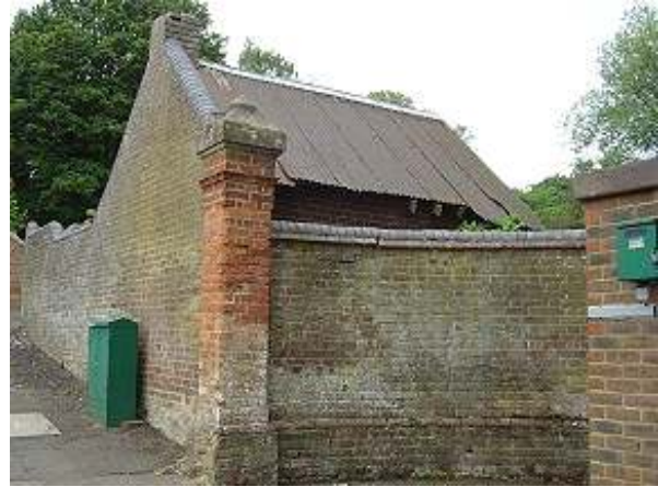
Cemetery piers, gates and building

Ensemble of piers and caretaker building to Cemetery. Late C19th. Caretaker's building backs onto Three Close Lane, the gable forming an integral part of the boundary wall to left and against which the left hand gatepier abuts. Unrendered dark purple and some buff brickwork with red dressings and stone cappings to the piers and half-round blue capping bricks to the boundary wall. Gatepier to right side has lost stone capping, left side has moulded base, quatrefoil decoration to front and chamfered top brought to an octagonal point. The original gates have been removed and replaced with an indented concave wall.