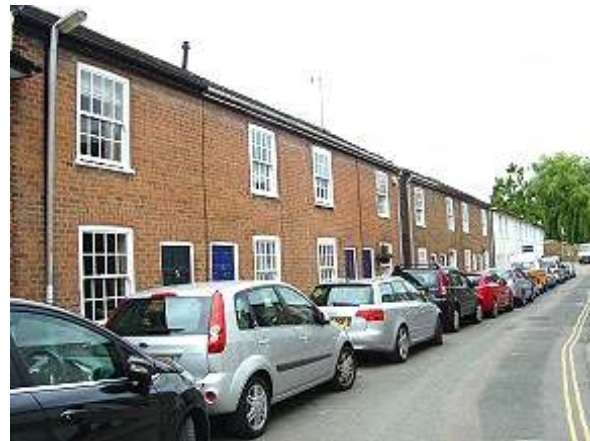
1- 15 Bridge Street

Nos. 9, 10, 11, 12, 13, 14 & 15 Bridge Street form a longer integral range of 7 modest two-storey terraced houses with single room, direct-entry plans, arranged symmetrically around a central alleyway (now part of