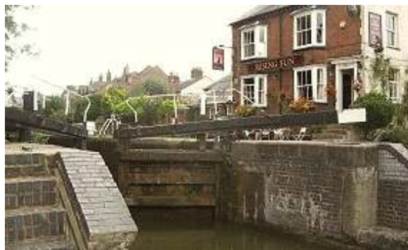
Rising Sun Lock (no. 55)

The Grand Junction Canal was opened from Brentford to Tring in 1798 and the entire route was completed in 1805, linking the Thames with canals in the industrial midlands. One of 20 locks constructed between Boxmoor and the Cow Roast.