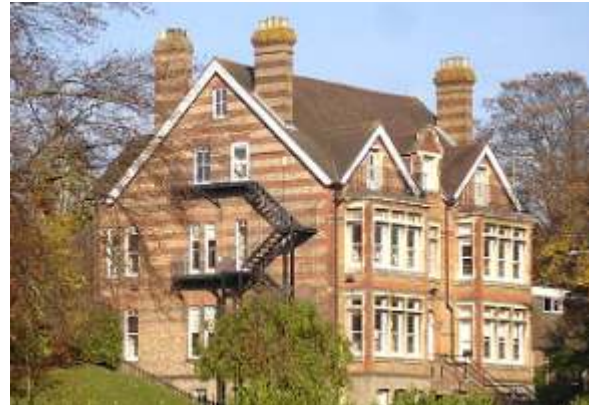
19 Kings Road

Two storeys with attic storey and prominent basement so that entrance and principal rooms are elevated. Double fronted house with principal room each side of central entrance. Symmetrical façade with central Dutch style gable with 2-over 2-paned sash over 2-light cross-mullioned window over entrance with semi-circular brick arch incorporating masonry keystone and supported on square piers with stone bases and capitals. Steps in two flights with landing have brick walls and stone capping up to four-panelled door, the upper 2 panels glazed. Large square bay window each side of entrance rise from basement to second storey, capped with moulded cornices and railings in front of shallow gables set back to the attic storey with window in each gable. Wide 3-light window to each floor, those to basement have segmental heads, those to the two principal storeys are cross-mullioned windows,