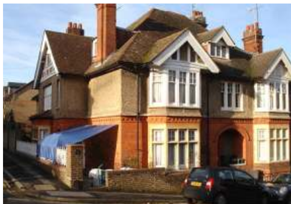
5 & 6 Cowper Road

Cowper Road elevation has gabled two-storey canted bay window each side of entrance. Attic has 3-light window with leaded lights. Upper bay windows have triple sashes with single sashes to the cants. 4 panes per sash to upper third, single panes to lower sashes. Lower bay windows have stone-mullioned cross-windows, 4 panes to the upper light, single paned lights below. To centre is triple sash window, 4 panes to the upper sash, single panes to lower sash over entrance porch with moulded brick surround, three centred arch and moulded string to outer side of arch with returned ends. Steps up to recessed 6-panelled door with glazed overlight and narrow door to right.