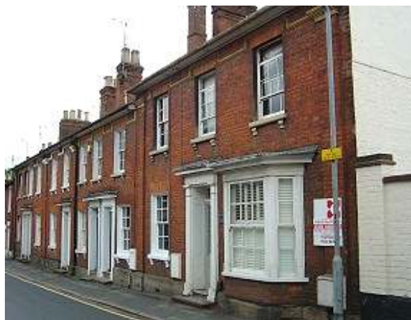
5, 6, 7, 8, 9 & 10 Ravens Lane

Nos. 6 & 7 and Nos. 9 & 10 are built as matched pairs with adjacent doorways and conjoined cornices. 6-