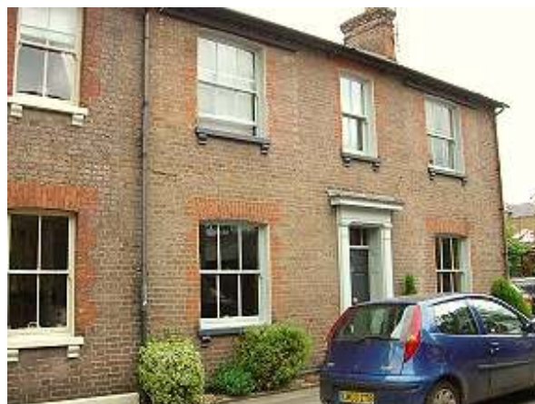
15 Manor Street

Manor Street has significant interventions on both sides of the street but the character of the locally listed