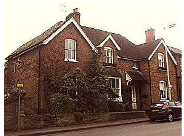
291 & 293 High Street

Main range has projecting wings with room on each floor each side of offset door and principal room, the left hand wing extending to rear and forming separate residence. 3-over-3 paned sash to each floor to the wings with cambered brick arches. Similar sash to main range window which breaks through the eaves and has a gabled roof and cast iron window box over canted bay window with hipped roof and 3-over-3 paned sash and 1-over-1 sidelights all to left of small 1-over-1 paned sash over lean-to roof in angle of wing with timber cheeks and bracket to left side. Stone steps up to 4-panelled door, the upper two panels