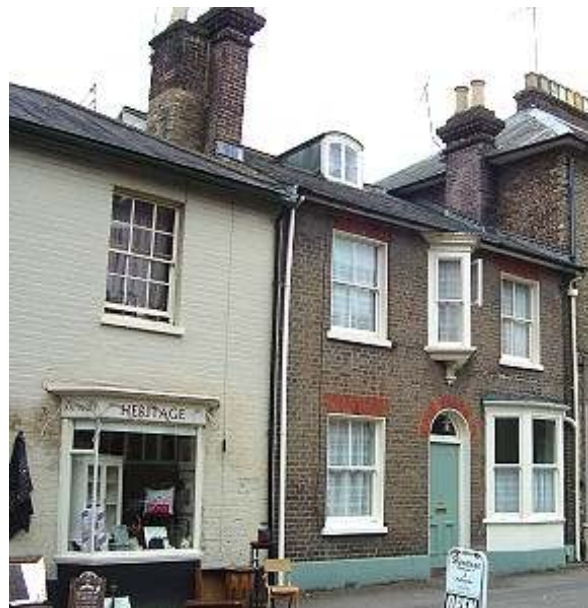
23 & 24 Castle Street

No. 24 Castle Street is an early C19th double-fronted central entry two storey house, the ground floor currently used as retail premises. Painted brick and hipped slate roof with painted guttering and brick stacks to each end – that to the left has been rebuilt, that to the right is taller and has a circular ceramic pot. Symmetrical frontage with 3 window range, the left hand and central window converted to 1-over-1 paned sashes, that to the right retains its 6-over-6 paned hornless sash. Central entrance with 2 panelled door,