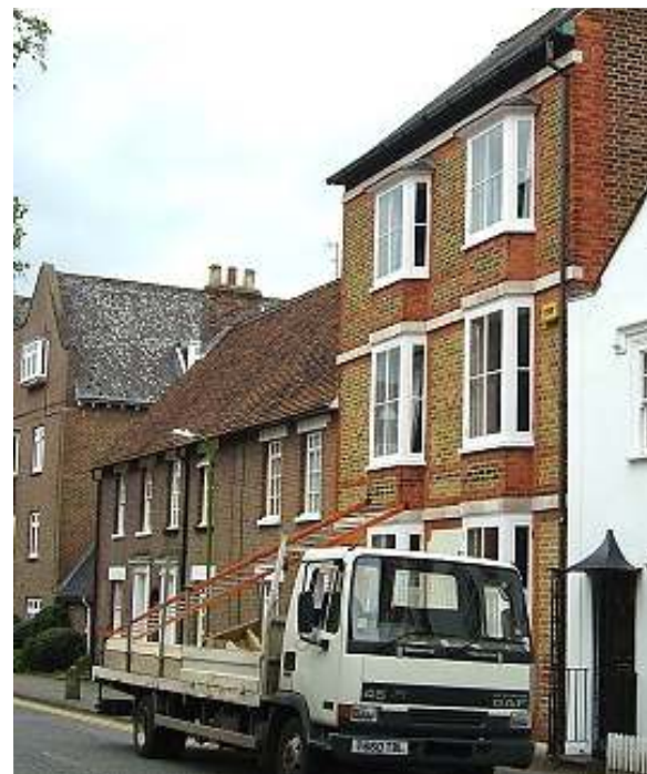
17, 18, 19 & 20 Castle Street

Castle Street was a key thoroughfare from the Castle to the High Street. No. 17 sits directly opposite the Grade 1 Old Hall of Berkhamsted School. The 'square' of buildings fronting Castle Street, Chapel Street, Manor Street and the High Street, of which No 17 forms a part were all linked to, and backed onto the grounds of Pilkington Manor, demolished in 1959. Many of the buildings in Castle Street are listed; No. 17 makes an important contribution to the street scene; all the houses on the east side of the street front directly onto the pavement; they have largely unspoilt C19th facades with a modestly stepped tile and slate roofscape, mostly uncluttered by rooflights and dormers, along its length.