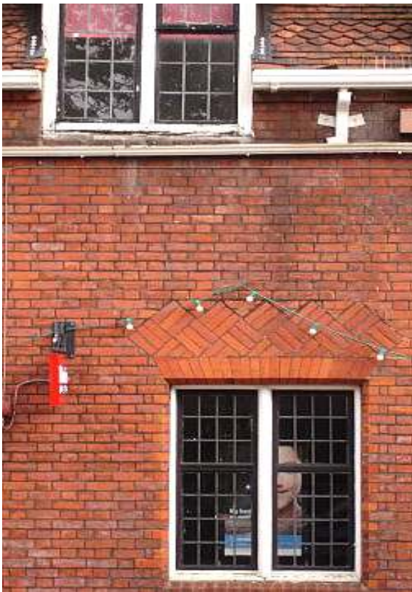
Creative use of brick and tile