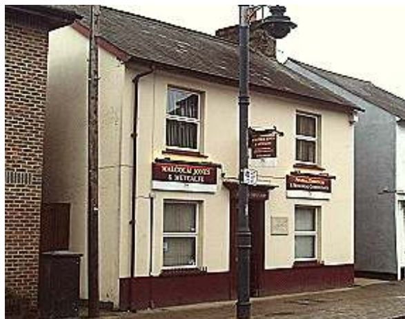
284 High Street

No. 284 is a modest domestic style C19th building with symmetrical façade fronting directly onto the High Street.