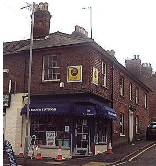
81 High Street

No. 81 fronts directly onto the pavement and sits prominently at the corner of the High Street and Victoria Road. It forms an integral group with No. 1, Victoria Road (q.v).