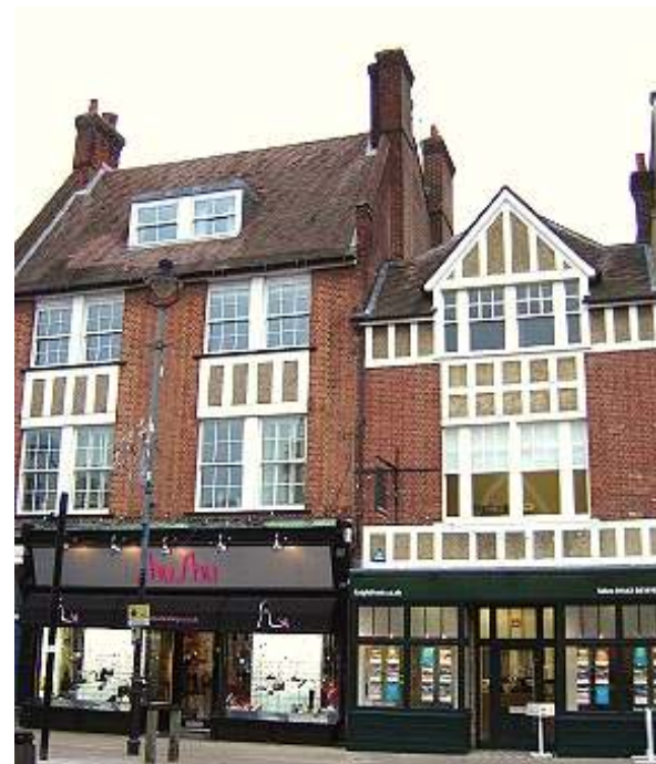
136, 138, 140 & 142 High Street

Nos. 136 & 138 High Street is a retail premises with accommodation over. Early C20th. Two storeys and prominent attic storey. Built parallel with the High Street, with rear range at right angles extending back to Church Lane. Double-fronted shop with wide single bay accommodation over. Clay tiled roof which sits lower than its neighbours, brick stack to right end and tall brick stack to left end, and higher hip of rear extension visible. Downpipe to left end. Brick and false timber framing with rendered infill panels and timber shop front. Wide central bay with a window on each floor, consisting of twin 6 over single pane sashes with 2 over single pane sidelights. The upper window breaks through the eaves with prominent gabled roof. False-framing in the gable, in 3 panels to each side of the window bay, in 10 panels between the windows, and in 11 panels across the façade between the fascia and first floor window, all with roughcast render infill panels. Brickwork flanking first floor window and framing above. Timber shop front has plain fascia and each side of double fronted shop front with twin panelled stall riser beneath window divided into 2 large panes, each pane with 3 paned toplights, canted in to recessed part glazed door with similar 3 paned overlight.