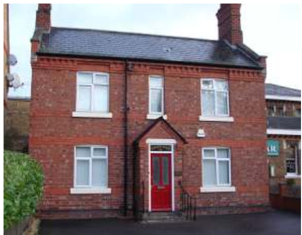
56 Lower Kings Road (Station House)

No. 56 is a former station master's house, principally detached but abutting station building at east side. Two storeys. Early C20th. Slate roof with tall brick stacks to raised and stone coped gable ends and circular pots. Downpipe to left of porch. Unrendered brick, mixing lighter red and pink brick with dark red dressings to the cornice and colourwashed red bricks to the porch and openings which extend in bands across the whole façade at sill level to both storeys and above the ground floor windows. The cornice has oversailing courses incorporating headers in the second band of two courses to form dentils, extending up into the course above with concave bricks above each dentil. Painted stone sills. All openings have slightly cambered arches, the arches of the windows to the upper floor breaking into the cornice. (See also Nos. 26 & 27 Station Road, q.v.) Symmetrical plan with room each side of entrance hall. C20th fenestration Two 2-light cross-windows on each floor flanking similar single window over gabled brick porch with slate roof, with oversailing courses on moulded imposts in the pediment, painted lintel and 4-