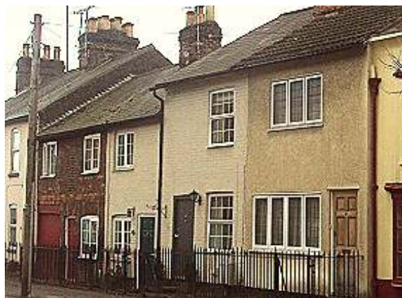
21, 23, 25 & 27 High Street

Nos. 25 and 27 form two houses in a terrace, late C19th or early C20th but possibly concealing earlier fabric. Slate roof to No. 27 with gable end to left, C20th pantiled roof to No. 25. Shared ridge stack with circular pots and lower stack to right end of No. 27. No. 25 has painted brickwork and brick dressings; No. 27 is