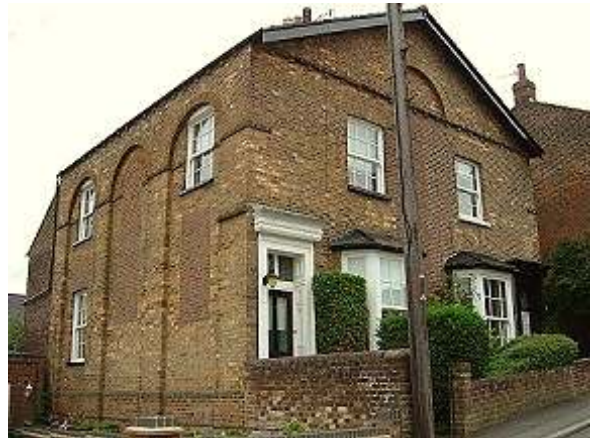
29 - 31 Highfield Road (Prospect Place Chapel)

The front elevation, which originally had central door with tall window above, now has symmetrical paired façade below the blind lunette in the pediment and widely spaced dentilled cornice, consisting 6-over-6 paned sash to left side and 2-over-2 paned sash with margin glazing bars to right side, both windows with very slightly cambered lintels, over pair of canted bay windows with hipped slate roofs, 2-over-2 paned sashes to the cants and 6-over-6 paned sashes, the right side adjusted to match the margin glazing bars of the window above. Tall outer doorcase on each side with panelled reveals, moulded architrave and cornice breaking forward. Overlight divided into two lights Left side has 4-panelled door, upper 2 panels glazed. Right side has 6 panelled door.