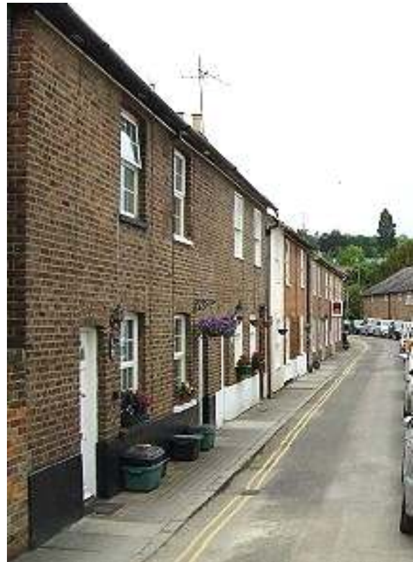
17- 28 Bridge Street

Bridge Street is a good example of well-preserved modest and relatively uniform terraced housing on both sides of the street, with subtle variations in the groupings of two to seven houses; these all front directly onto the pavement (which retains its original kerbing) and have uncluttered facades and simple roof profiles unencumbered with rooflights or dormers.