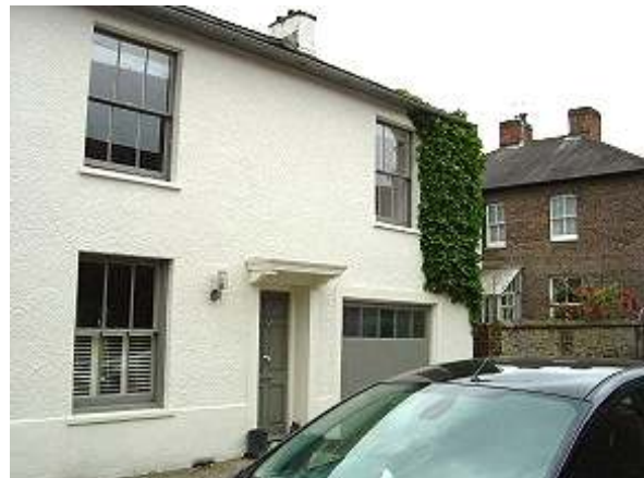
31 Bridge Street

Bridge Street has well-preserved, modest and predominantly terraced housing on both sides of the street; the houses all front directly onto the pavement (which retains its original kerbing) and have uncluttered facades and simple roof profiles unencumbered with rooflights or dormers. No. 31 is of slightly higher status being double-fronted and the only house in the street with a canopy to the entrance.