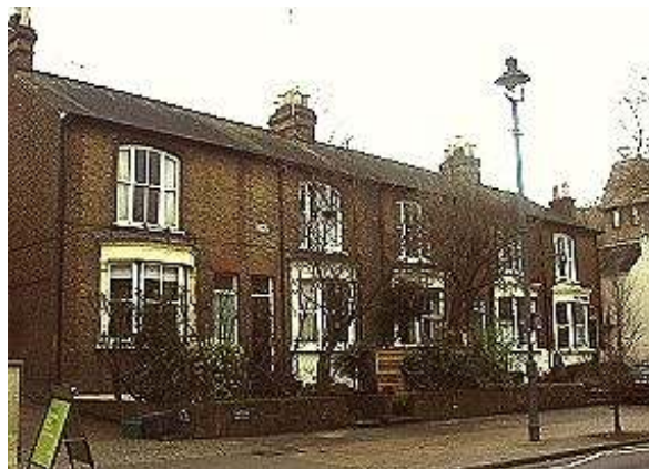
251, 253, 255, 257 & 259 High Street (Camilla Terrace)

All doorways have cambered brick arches. Stone steps up to 4-panelled door and overlights. Terrace name