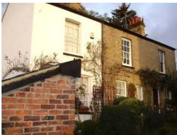
2, 3 & 4 Cambridge Terrace

Nos. 2, 3 & 4 Cambridge Terrace are a terrace of three houses. Late C19th. Two storeys. Slate roof with gable ends. Unrendered brick stack between Nos. 2 & 3 and at right end, both with circular pots. Buff brick, No. 2 is painted. Single room wide, direct entry plans. All openings have slightly cambered brick arches. Nos. 2 & 3 form mirror pair with 6-over-6 paned sash over similar sash between the doors, that to No. 2 is of narrow planks with small glazed panel with lean-to slate roof supported on shaped brackets, that to right is panelled. No. 4 at right end has 2-over-2 paned sash over similar sash to right of panelled door.