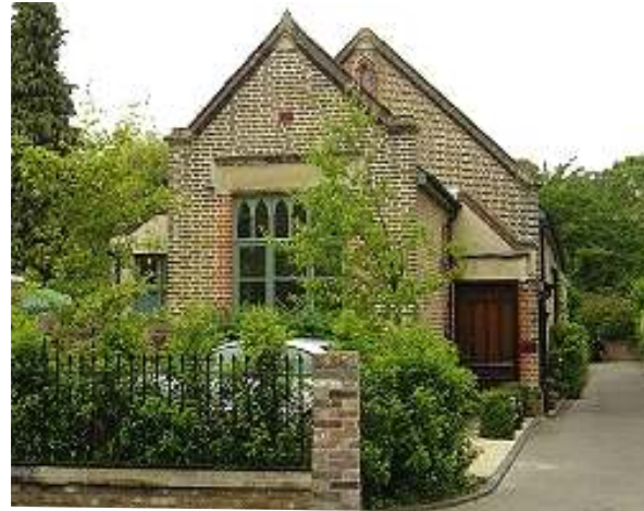
12A Chapel Street (former Victorian Infants School)

Five tall, narrow window openings to the right side of the main range. Three hipped dormers to west side. Iron railings on low dwarf wall to front.