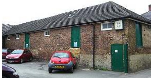
Malting on corner of Chapel Street and Bridge Street

Elevation facing Bridge Street has 3 similar 2-light windows and four windows (two 3-light; two single light C20th) towards north end. 5 blocked doorways with c