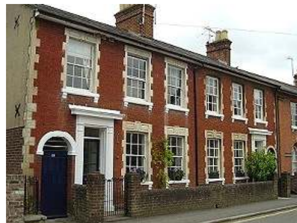
13 & 14 Chapel Street

Low brick wall with half round cappings and wrought iron gates at each end.