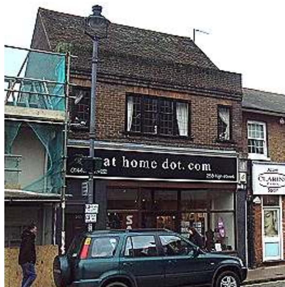
258 & 260 High Street

Nos. 258 & 260 fronts directly onto the High Street.