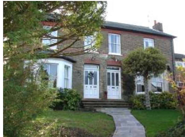
5 & 7 Kings Road

Nos. 5 & 7 Kings Road form a pair of semi-detached villa style houses. Late C19th. Slate roof with gable end brick stacks. Unrendered buff and darker brick with colourwashed red brick dressings to the window openings, carried across the façade as banding at first floor sill level. Painted rendered surrounds to bay windows. Rectangular stone plaque with inscription 'HOPE VILLAS'. Two storeys. Mirror pair of houses, with principal room each side of adjacent entrance halls. Window openings have slightly cambered arches. Each house has two 2-over-2 paned sashes over gabled bay window with hipped slate roof also with 2-over-2 paned sashes to centre and cants beside shared stone steps up to door with chamfered reveals 3 panelled base, the upper half with 3 glazed panels and narrow rectangular overlight. No 5 has C20th low extension at left end.