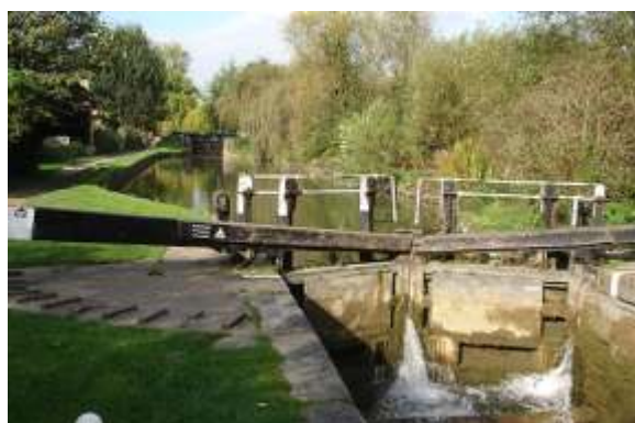
Gas Lock (no.2)

The Grand Junction Canal was opened from Brentford to Tring in 1798 and the entire route was completed in 1805, linking the Thames with canals in the industrial midlands. One of 20 locks constructed between Boxmoor and the Cow Roast