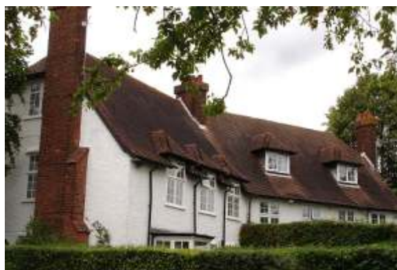
86 Cross Oak Road

No. 86 and No. 2 Greenway form a cranked pair of houses on the north corner of Cross Oak Road and Greenway. 1920's in Arts and Crafts style. Quarter-hipped tiled roofs with unrendered centre ridge stack and stack set forward of the ridge at each end with offsets. Painted roughcast render. Two storeys. No. 86 has attic. Upper storey range of 3 windows with half dormers with hipped roofs and 2-light cross-windows with 4 panes over 6 panes to No 2 Greenway, modified to No 86 so as to accommodate attic storey. No. 86 has 2 similar windows flanking glazed door with 10 panes to garden, all to left of deep flat-roofed bay with similar window to centre and cants. No. 2 has 2 similar windows to right of similar bay, entrance to flank wall facing Greenway with asymmetrical fenestration and semi-circular arched outer doorway to recessed door, 3 panels to base and 9 panes to upper half.