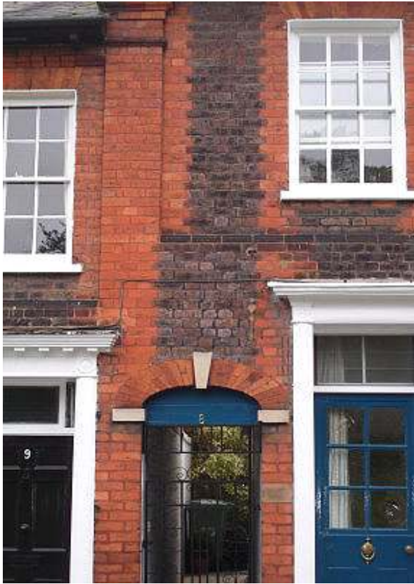
Combination of elements in highly detailed facade