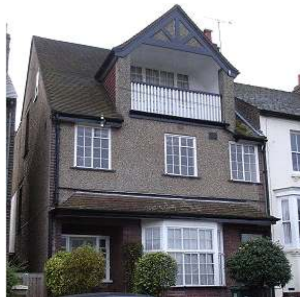
19 Charles Street

Large, slightly off-centre attic gable has recessed French windows, upper part glazed, with 8 paned sidelights and balustrade to front, the central balusters being diagonally set. 3 window range of 2-light casements, 8 panes per light. Prominent canted bay window to centre with 3-light cross-window to centre and single cross-window to each of the cants, each light with 4 panes above and 6 panes below. The roof