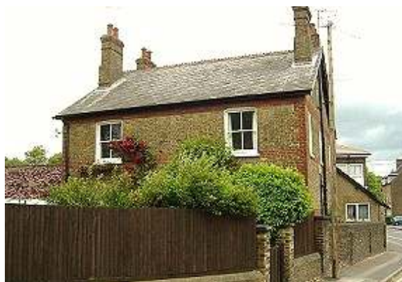
Adelbert House, Mill Street

Adelbert House has historical links with the former