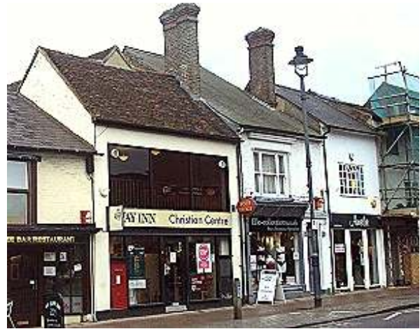
264, 266 & 268 High Street

No. 266 fronts directly onto the High Street and forms a central anchor in this range of four modest shops with the roofs stepping down from right to left.