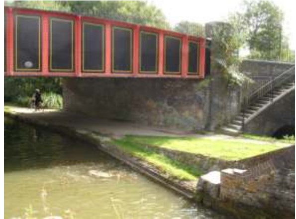
Road bridge over Grand Union Canal

Road bridge (140C) over Grand union Canal. C19th, the abutments probably earlier than the bridge. Painted cast iron with brick abutments at each end. Bridge has gently curving parapet divided into 16 sections on outer face by riveted upright stanchions. Panels picked out with yellow border. Parapet surmounted by low hooped railings, Abutments with double piers at each end and at each side (except for north-west end which is single pier) of buff and grey brick with blue engineering bricks used as heavy cappings and angled plinth bricks, with large stone cappings to the piers. Hooped railings continue beyond the abutments, Steps down from pavement on south west side with hooped railings and segmental arched bridge over River Bulbourne.