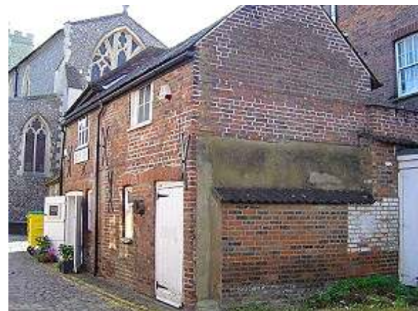
Building on Church Lane, Trilbys and Tiaras, at the rear of 124 High Street (included with entry for no. 124)

Several 'X' tie-plates across the front elevation. Right gable end is blind, and partially rendered to loft storey level, and low stub wall attached.