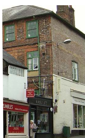
1 Lower Kings Road

Retail premises consisting of pair of shops with accommodation over. Late C19th. Three storeys. Slate roof with unrendered brick stacks at each end. Two top floor windows are expressed as slightly raised gables with wavy bargeboards and drop finials. Downpipe to centre, at right end and to left flank. Painted rendered brick. Two single bay width shops with two storeys of accommodation above. Two 2-over-2 paned sashes to each of the upper floors, first floor windows have painted splayed lintels with keystones. Simple shop front to left with low panelled stall riser, single paned shop window, steps up to recessed door and deep fascia above canopy. Panelled piers to each side of shop to right, which has C20th glazed shopfront.