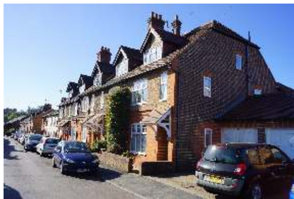
12, 14, 16, 18 & 20 George Street

base, top incorporating 'Georgian' fanlight; No.14 with 6-panelled door; No. 16 has 6-panelled door the upper panels glazed; No. 8 has 6-panelled door; and No. 20 has original door with panelled base, glazed upper section of 2 panels and top section of two rows of panes, the upper panes with arched heads. Plank doors to alleyways. All doors have 6-paned overlights