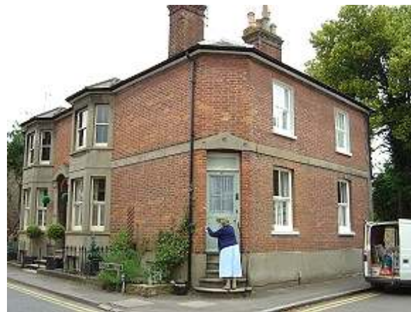
21 Chapel Street

Chapel Street is composed principally of elegant, modest late C19th semi-detached or terraced housing, but punctuated by individual exceptions such as the Malting and School. Roofscapes are largely unmarred