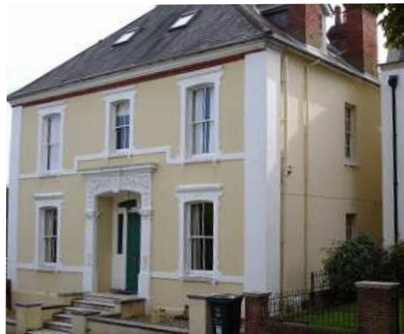
36 Kitsbury Road

No. 36 Kitsbury Road is a substantial detached house, late C19th. Steeply-pitched hipped slate roof with crested ridge tiles and brick and stone moulded cornice. Two dormers with fretted bargeboards to north side. 2 rooflights to west side. Unrendered brick ridge stack and stack to south side hip. Painted rendered brick and stone dressings and corner pilasters. Two storeys with attic storey, with central entrance and room each side facing Kitsbury Road, and two prominent bays to north side elevation. All windows to west and north elevation have cambered heads with 1 over 1-paned sashes except attic dormers which have 2-over-2 paned sashes. 6-over-6 paned sashes to south side. Windows have eared and lugged architraves and shallow flat cornices breaking forward with sunk lozenge decoration below. Sills are bracketed and banding between extends across the façade at first floor level, stepping up over the entrance, and between corner pilasters and entrance to ground floor. Kitsbury Road elevation has 3-window range over central doorway flanked by similar windows. Steps up to entrance which has elaborate