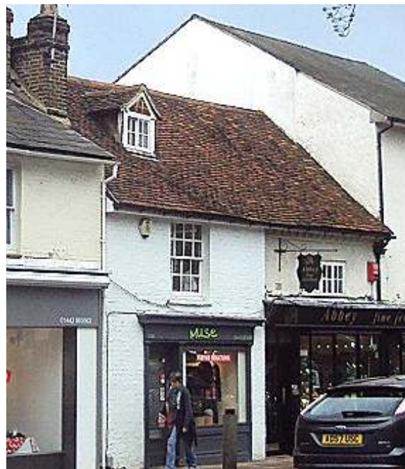
236A & 238 High Street

Nos. 236A & 238 are an early and modest pair of shops with good survival of early traditional features including the tiled roof, irregular fenestration and shop fronts.