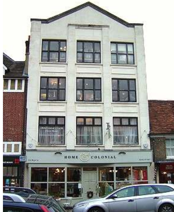
134 High Street

Brandons probably built the premises as a large store. Imposing building forming part of Grab-All Row which rises strikingly besides its neighbours.