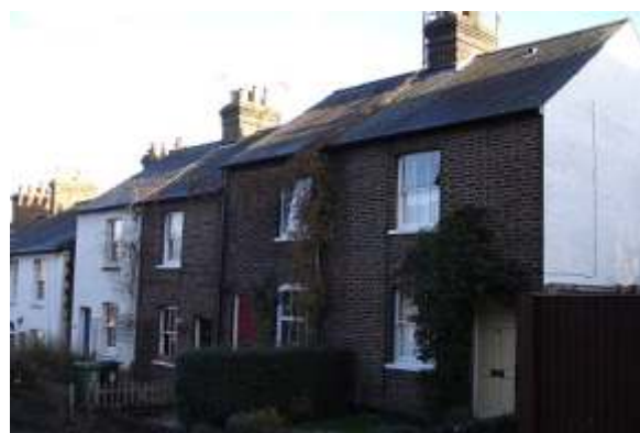
43, 45, 47 & 49 Cross Oak Road

Nos. 43, 45, 47 & 49 form a terrace of two pairs of houses on the east side of Cross Oak Road, the roof breaking in the centre with lower roofline to left hand pair. Slate roofs with gable ends. Single central downpipe. Central brick ridge stack to each pair. Unrendered dark purple brickwork, except for No 43 which is painted. Each pair has mirrored single-room wide, direct entry plans.