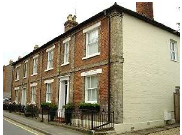
10 & 11 Manor Street

Nos.10 & 11 form a pair with Nos. 12 and 13 Manor Street (q.v.). As both No. 10 & 11 retain original detailing, their strong identity as an unaltered pair of houses is mutually reinforced.