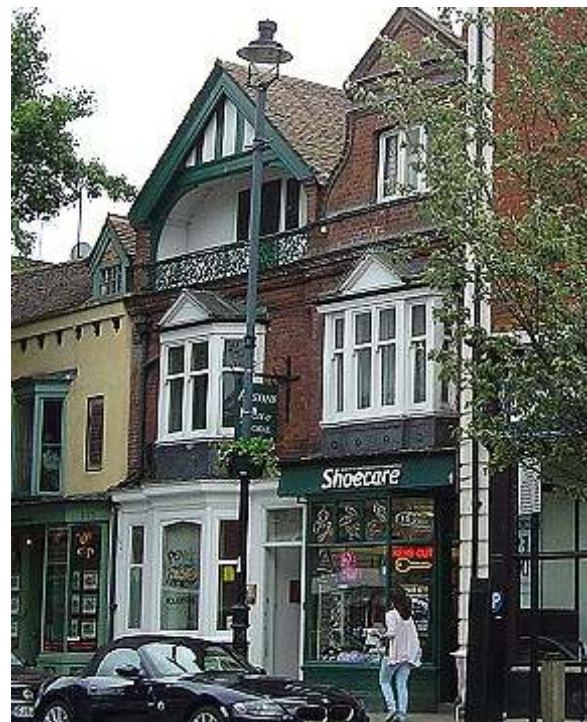
175 & 177 High Street

Nos. 175 and 177 High Street are a pair of office/retail premises with accommodation above. c.1900. Built as a pair but with individual façade detailing. Two storeys with prominent attic storey. Clay peg-tiled roof, stacks to each end, running parallel to the High Street but the façades expressed as two large gables, that to right formed as Dutch gable in brick with heavily moulded pediment and 3 light window under slightly cambered arch with alternating diamond and rectangular paned leaded lights to the outer lights; that to left has moulded painted timber bargeboards and false framing and roughcast rendered painted infill in the upper gable, with curved bracing springing from stub brick piers to front of recessed balcony bay which has balcony door, the upper part of the door glazed, and single paned sidelights, all with diamond and square paned lead lights. Decorative wrought iron balcony balustrade. Unrendered brick and timber bay windows and shopfronts, No. 177 breaks forward slightly of No. 175 and is slightly narrower; the moulded brick cornice above the first floor windows unifies the frontage by running across both façades. Downpipes at each end and to sides of bays with hoppers.