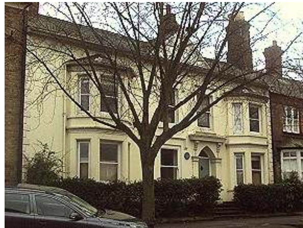
71 High Street

Blue Heritage Trail plaque to left of door. Hedge to shallow front enclosure which has lost its front railings.