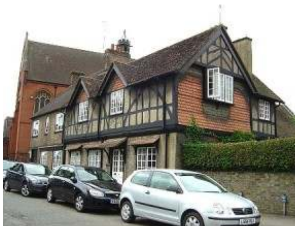
62 Castle Street (St. George's)

All casements have 8 panes per light, with two 2-lights to upper storey, and three 2-lights to ground floor. Door has two leaves, each with panelled base and 8 panes to upper half. All three windows and door have tiled canopies supported on shaped wooden brackets. N. end elevation has 3 light 'oriel' supported on single shaped bracket above 3-light window; a 2-light window on each floor to rear wing, and two 2-light windows to single storey range.