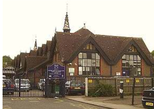
Victoria Church of England School & Nursery

South block has series of 4 large gables running east/west and single large 9-pane window with gabled dormer with shaped bargeboards at south end.