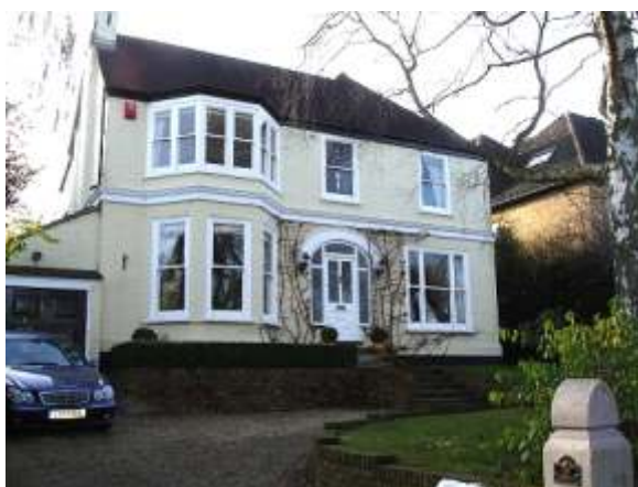
11 Shrublands Road (Rowans)

No. 11, Shrublands Road is a detached house. 1890s. C20th tiled roof with rendered stack at left end. Painted brickwork. Two storeys. Double-fronted house with principal room each side of entrance hall. Plat band with moulded cornice across façade and returning along flank walls. Two-storey projecting flat-roofed canted bay window to left, with twin 1-over-1 paned sashes to centre and cants over 1-over-1 paned larger sashes to centre and cants. Two 1-over-1 paned sashes over central door in wide segmental arched opening with glazed overlights and sidelights and door, upper half with 2 glazed panels, 4 panels lower half with cartouche design, and tripartite sash with 1-over-1 panes to centre and sides to right. Lean-to garage at left side. House is raised with steps up to front door flanked by raised beds.