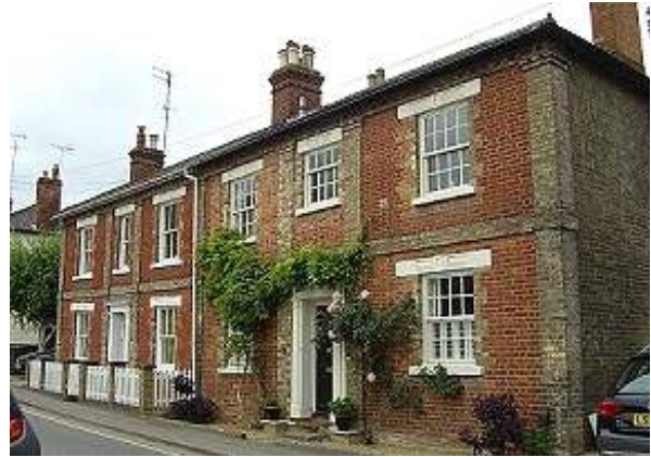
12 & 13 Manor Street

Nos. 12 and 13 Manor Street are a pair of mid C19th, double fronted, semi-detached houses. Hipped roof, No. 12 retaining its slate roof, No. 13 replaced in C20th, with central and end stacks with an assortment of circular ceramic and clay pots. Central Downpipe. Colourwashed red brick (more of the colourwash and some tuck pointing survives to No.12) to the front elevation with buff brick dressings which consist of quoins, piers at ends, to centre and flanking the central door and upper floor window and as plat band between the storeys. At eaves level, the cornice is 3 bricks deep, matching the plat band, but with alternating red and buff bricks in the middle course. All windows have eared stone lintels with incised keystone and flanking lozenge decoration.