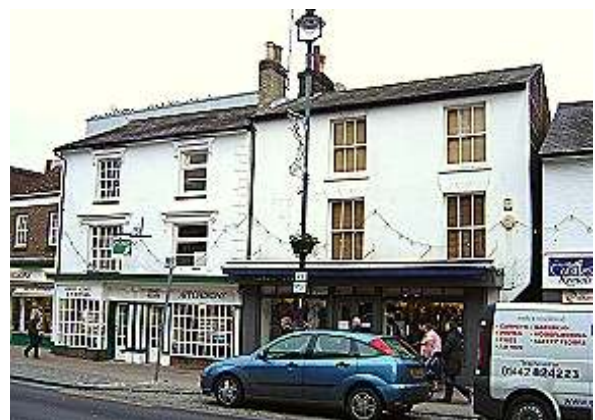
152, 154 & 156 High Street

No. 152 High Street is a retail premises with accommodation above. 3 storeys. C19th but possibly with earlier fabric concealed. Slate roof, brick stack with circular pots at left end. Painted render above painted brick and timber double-fronted shop front. Range runs parallel with the High Street and extends back to Church Lane at the rear.