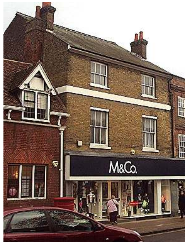
218 & 220 High Street

Nos. 218 and 220 is the tallest building in the range as the roof steps down to the right. H.C Ward & Son occupied the property in C19th and early C20th, later Sharlands, now M & Co. Fronts directly onto the pavement.