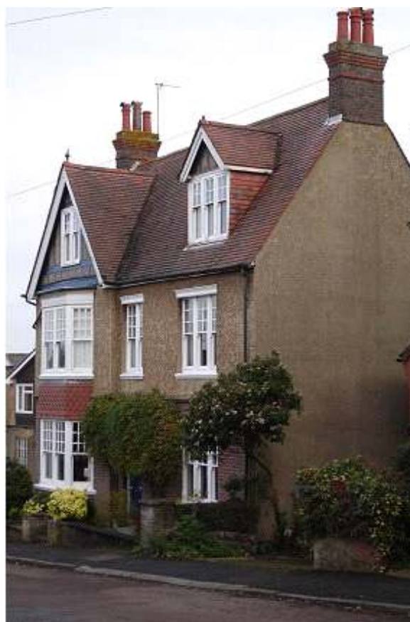
25 North Road

No 25 is an unaltered Edwardian style detached house occupying a prominent position on North Road.