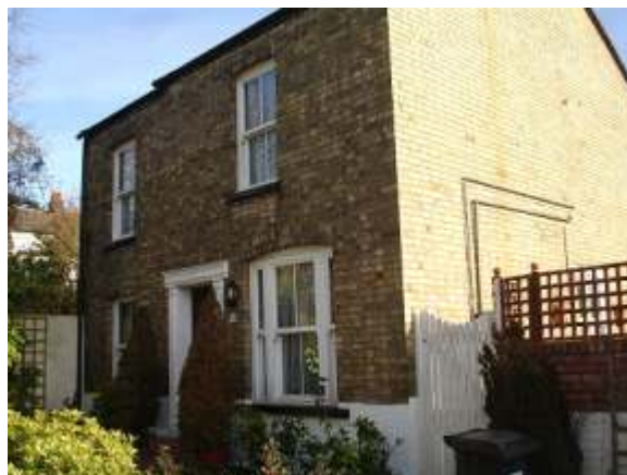
1 Cambridge Terrace

No. 1 Cambridge Terrace is a detached house. Late C19th. Two storeys. Tiled roof with gable ends, the left end bay drops slightly. Downpipe at left end. Brick stack at right end with circular pots. Unrendered buff brick, plinth painted. Room to each side of entrance hall. Two 2-over-2 paned sashes to upper floor. Similar sash to left and tripartite sash to right with 2-over-2 panes flanked by 1-over-1 pane sashes. All window openings have slightly cambered brick arches. Doorcase with pilasters and low entablature with dentilled cornice breaking forward slightly. 4-panelled door.