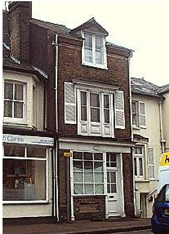
303 High Street

No. 303 High Street is house with former retail premises at ground floor. Venetian style. Two storeys and attic storey. Probably late C19th. Slate roof with tall brick stack at left end. Downpipes to each side. Buff brickwork with red brick dressings with 'in and out' quoins and some banding. Narrow one room wide plan. Attic storey has 2-light window, 2 panes per light breaking through the eaves with slate gabled roof and shaped bargeboards. Eaves have brick cornice and two courses of studded bricks below. Prominent balcony style pilastered tripartite window to first floor which has central 2-over-2 paned window with 1-over-1 paned sidelights, each window with lozenge or diamond chamfered and moulded panelled base between the pilasters. Cornice breaking forward at top with detached fixed flanking louvred shutters. Ground floor has cornice breaking forward over plain fascia over 9 paned shopfront with 3 toplights to left of door with panelled base and 4 panes to upper half and 4 paned tall overlight. Pilasters each side of door and shop window, with knobbed mouldings at mid-window level, troughed mouldings above and below, flanked by tall round-arched brick niches with buff brick in the niches. Blind panel also with buff brickwork in the recess below the shop window.