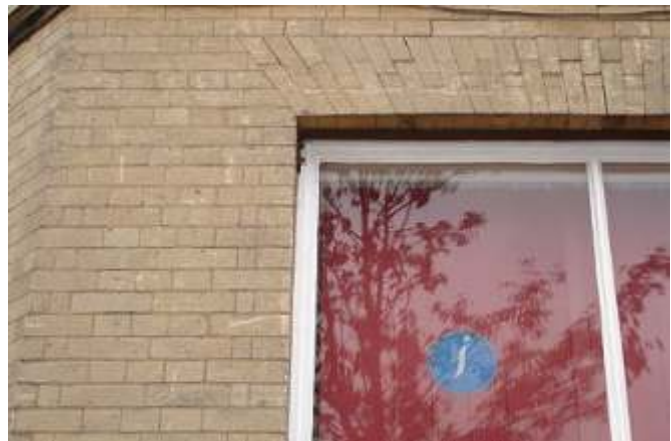
Finely pointed gault brickwork