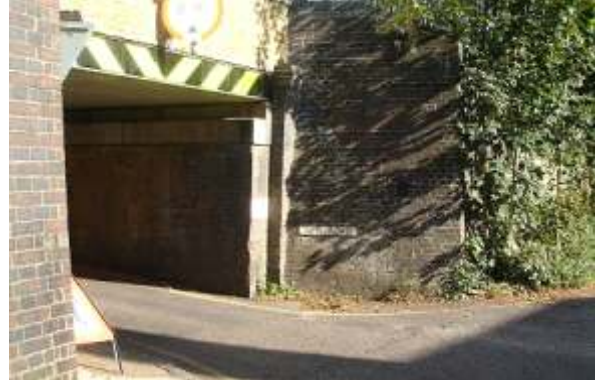
Railway bridge on Station Road

The construction of the Birmingham to London Railway began in 1834; the local contract was given to W. & L. Cubitt who employed 700 labourers at its peak of building works. It can be seen as having been partially mapped on the 1841 Tithe Map, not proceeding past Ravens Lane, through land owned by Lord Brownlow (Adelbert Egerton) of Ashridge (Map 4). The original Elizabethan-style railway station, which had no platforms, was replaced in 1875 by the present station buildings. The London and Birmingham Railway was