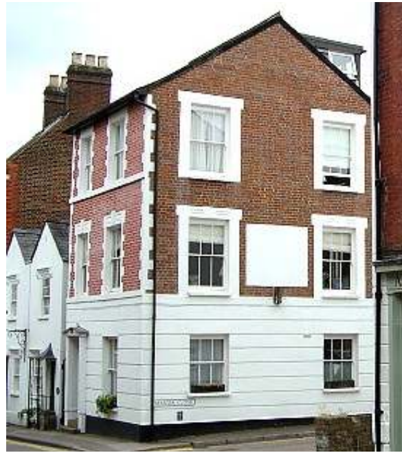
14 Castle Street

Castle Street was a key thoroughfare from the Castle to the High Street. No.14 sits directly opposite the Grade 1 Old Hall of Berkhamsted School. The 'square' of buildings fronting Castle Street, Chapel Street, Manor Street and the High Street, of which No.14 forms a part were all linked to, and backed onto the