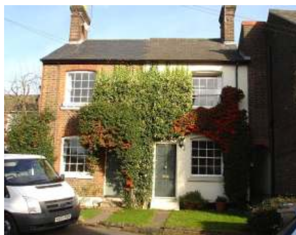
13 & 15 George Street

Nos. 13 & 15 are an unspoilt pair of C19th houses, in a cluster.