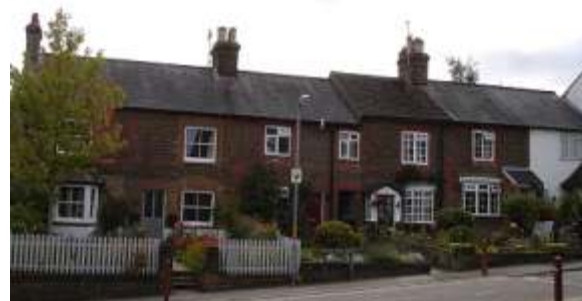
21, 23, 25, 27 & 29 Cross Oak Road

Nos. 21, 23, 25, 27 & 29 is a terrace of five houses, on the east side of Cross Oak Road, the roofline breaking between Nos. 23 and 25. Late C19th. Slate roof with gable end rendered stack at left end, unrendered brick ridge stacks between Nos. 21 and 23 and Nos. 25 and 27. Assorted pots, with unusual bellied pot to centre of No. 21's stack. Unrendered buff brickwork with red brick dressings to the openings, as banding below the upper floor windows and more randomly as vertical banding. No. 29 is painted.