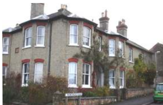
1 Montague Road

1 Montague Road turns the corner and links with the terrace on Charles Street. Late C19th. Shallow pitched hipped slate roof. Two stacks with pots in buff brickwork with red brick dressings to the caps and further stacks in similar style to service range. Unrendered buff brickwork with colourwashed red brick dressings to the openings. Two storeys. Principal room to each side of entrance hall with service range with lower roofline extending south up Montague Road. Symmetrical arrangement to main range with two-storey canted bay window with hipped roof each side of narrow window over doorway. All windows are 2-over-2 paned sashes with cambered red brick arches. Doorway has semi-circular arched opening and recessed 4-panelled door, the upper 2 panels glazed, with narrow panels to each side, the upper half glazed and glazed overlight. Service range continues to right with 2-window range and door. Elevation fronting Charles Street continues as regular terrace ('Montague Villas') extending eastwards.