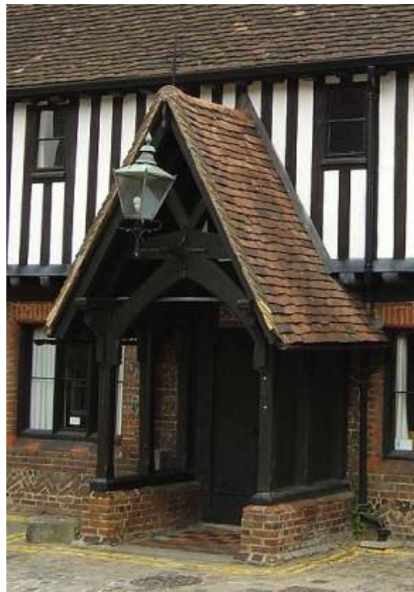
Pilastered doorcases and a timber framed open porch