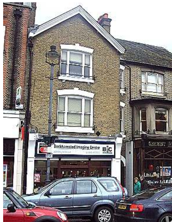
226 & 228 High Street

Nos. 226 & 228 is a retail premises with accommodation over. Mid C19th, possibly earlier fabric concealed. Three storeys. Slate roof, front gable to left end with moulded bargeboard. Tall brick shaft to left side. Downpipe to left side of front wing. Unrendered buff brickwork and painted stone dressings to windows. Built as an L-shape with front projecting 3-storey wing and the top of the 'L' running into No. 224 High Street (qv). Wide tripartite sash to each of the upper storeys of the projecting wing and window on each floor over semi-circular arched opening to right. All openings have cambered heads with keystones, 1-over-1 pane sashes and wrought iron window box rails with fleur-de-lis ends. C20th shop front with deep fascia with panelled pilasters and shaped brackets to the ends. Symmetrical arrangement of door of two leaves with moulded pilasters and headrail to centre with continuous overlight, flanked by large paned windows with 2 paned toplights and 2 panelled stall risers.