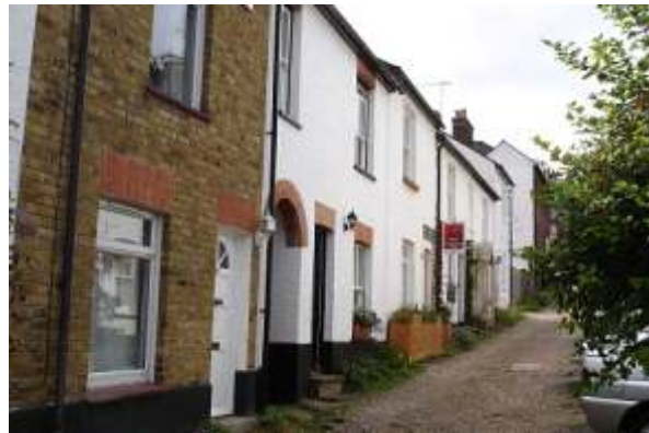
1, 2, 3, 4, 5, 6 & 7 Middle Road

Nos. 2 & 3 form a symmetrical pair with 8-over-8 paned sashes at each end with doorways, that to No. 2 has shallow latticed gabled porch, that to No. 3 has door with two panelled lower half, upper part glazed flanking semi-circular arched alleyway door and blind