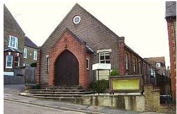
Christian Science Society

Chapel house (q.v) sits in line with and to rear of the Chapel.