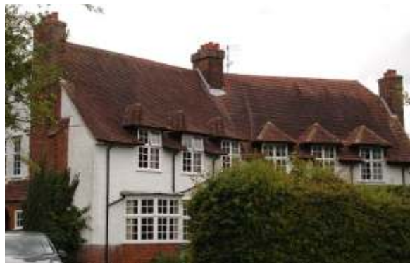
88 Cross Oak Road

No. 88 and No. 1 Greenway form a cranked pair of houses on the north corner of Cross Oak Road and Greenway. 1920's in Arts and Crafts style. Quarter-hipped tiled roofs with unrendered centre ridge stack and stack set forward of the ridge at each end with offsets. Painted roughcast render. Two storeys. Prominent upper storey range of 6 windows with half dormers with hipped roofs. All have a 2-light cross window with 4 panes over 6 panes. No. 88 has 2 similar windows flanking glazed door with 10 panes to garden, all to right of deep flat-roofed bay with similar window to centre and cants. Lean-to porch with semi-circular arched porch to left flank well of No. 88. Nos. 1 has 2 similar windows to left of similar bay, entrance to flank wall facing Greenway with asymmetrical fenestration and shallow porch with semi-circular arched entrance and steps up to door, 3 panels to base and 9 panes to upper half.