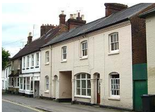
25, 26, 27 & 28 Castle Street

5 window range all with 3-over-3 paned sashes. No. 25 has wide shop window, 3 lights wide, each light divided into 3 panes to left of entrance doorway with 4-panelled door, the upper two panels glazed with etched glass and fanlight with diamond leaded lights. 8-over-8 paned sash to right end with trefoil decoration in the cambered arch. Carriageway walls are painted. No. 26 has a 2-over-2 paned sash to left of entrance with step up to 4-panelled gothic style door with diagonally-set planking in the chamfered-edged panels and plain glazed overlight.