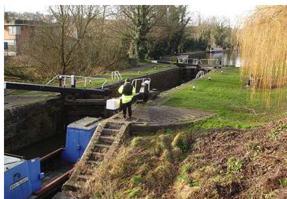
Broadwater Lock (no. 53)

The Grand Junction Canal was opened from Brentford to Tring in 1798 and the entire route was completed in 1805, linking the Thames with canals in the industrial midlands. One of 20 locks constructed between Boxmoor and the Cow Roast