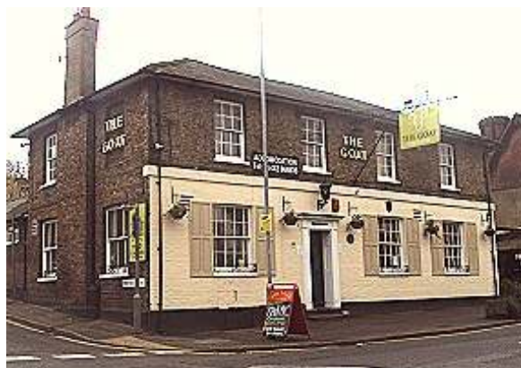
83 High Street (The Goat PH)

Blue Heritage Trail plaque to right of door. Stone drinking troughs to pavement outside. The public