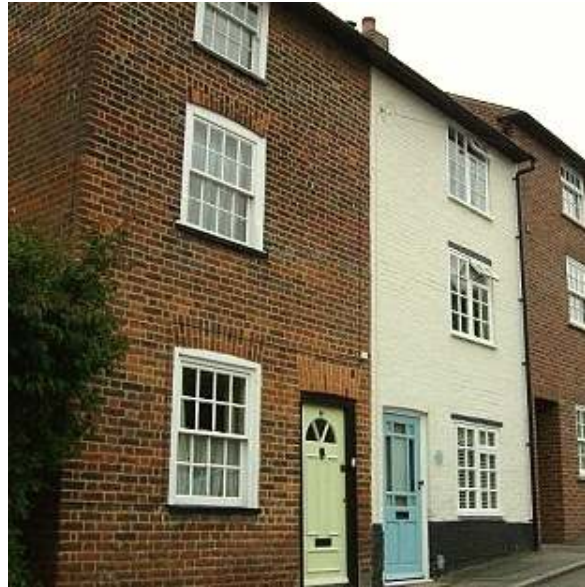
33 & 35 Highfield Road

Nos. 33 and 35 are unusually, three storeys and front directly onto the pavement of Highfield Road, which formerly led up to Highfield House, now demolished.