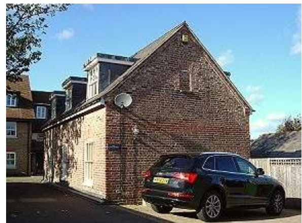
The Chapel House

The Chapel House, early C20th, now converted to residential use. Simple rectangular building of one storey with attic. Unrendered purple brick with red brick dressings. Slate roof with gable ends. Three flat roofed dormers with lead cheeks on south side over three 3-over-3 paned sashes. Small blocked windows near to apex in each gable end, now both blind. Four similar dormers on north side which has 6-over-6 paned sash to left of plank door with overlight and timber and glazed link to former outbuilding to right which has corner stack with large cylindrical pot.