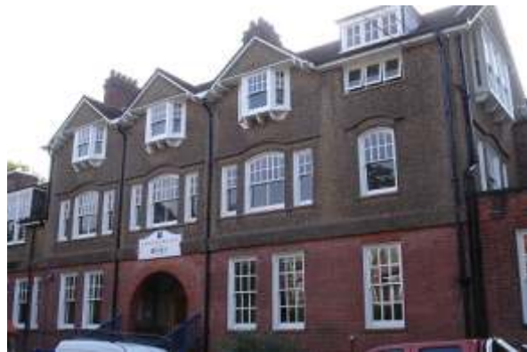
Berkhamsted Preparatory School

Lower range to left is of 4 bays, the left end bay