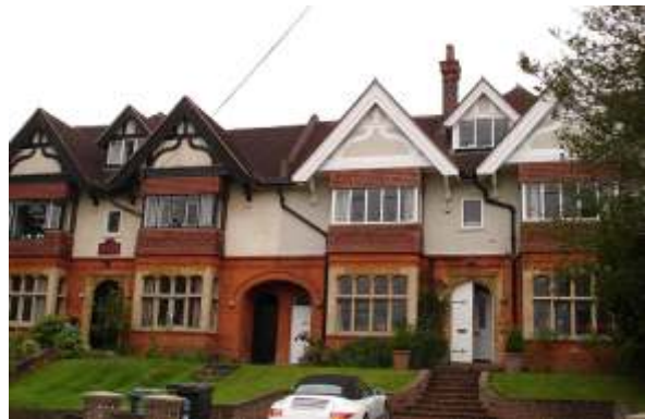
5 & 7 Shrublands Road

Nos. 5 & 7 Shrublands Road are a mirror pair of large semi-detached houses, Dunsland to left converted to residential home. 1898. Tiled roofs. Moulded bargeboards to attic dormer and gabled bays, those to the latter are supported on shaped brackets springing from corbels. Two brick stacks with assorted pots to Mullions. Cranked downpipes between the bays and at each end. Red/orange brick to ground floor with stone dressings to windows and doors, roughcast render and patterned tile-hanging to the bays, and false timber-framing in the gables. Symmetrical layout, each house with principal room each side of entrance and pair of alleyway doors between and narrow recessed bay at each end. All windows have rectangular leaded lights except for left hand upper floor bay window (altered to tripartite window). Opening casements in metal. Each house has 3-light attic window over single light window over doorway. Projecting gabled bay with false ogee bracing over 5-light window with single lights to the sides, plain tiled between the gable tie-beam and window-head, the aprons similarly tiled but with 3 bands of patterned tiles across the centre. Ground floor bay windows are 4-light stone cross-mullion windows with four-centred arched heads. Flat band with dentiled brickwork to lower edge and moulded cornice to top edge across the whole façade. Flat arched stone doorways have label moulds and pointed arched doorways with sunk spandrels. Vertical planked door of