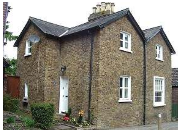
3 & 4 Chesham Road

Nos 3 & 4 are a pair of two-storey mid to late C19th, semi-detached houses. Unrendered buff brickwork, also used for all dressings. Slate roofs, the mirrored L-shaped plans (with the top of the 'L' fronting the road) creating a valley gutter where the stack sits, with circular and octagonal ceramic pots. Thin bargeboards to front and side wings and central downpipe. The front probably had paired 2-light casements 6 panes per light to each floor, but only the top right hand window survives; on the left side the casements have been replaced with 2 panes per light, and the ground floor right hand window has been enlarged into an 8-over-8 paned sash with moulded architraves. All other openings have slightly cambered brick arches. Simple plank doors. The side wings forming the base of the 'L' have a single window on each floor.