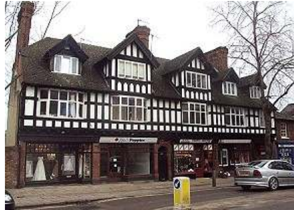
96, 98, 100, 102 & 104 High Street

The two pairs of shops to left have a symmetrical composition of smaller 3-light dormer each side of two large 5-light dormers above 4 window range of canted bay cross-windows with 3 centre lights and canted single lights. Each pair of shops has mirror arrangement of shop windows with one large panel, off-centre door and narrower panel. Larger panels have 16 paned toplights, narrower panels have 4 paned toplights. Recessed doors, with panelled bases, upper part glazed with 4-paned overlights. Brick pier with moulded blind panel at top between Nos. 98 and 100 and Nos. 102 and 104. Rounded triple-arched