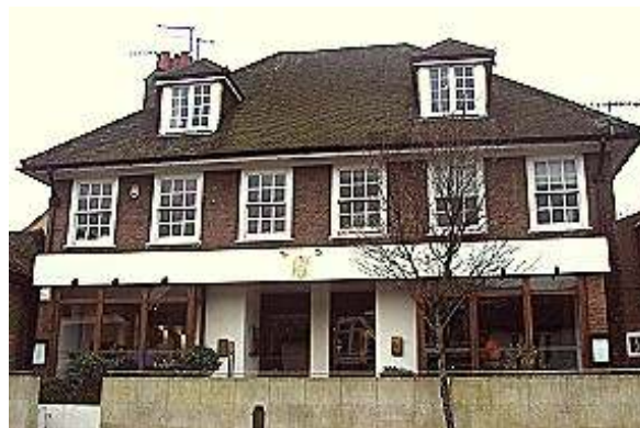
247 & 249 High Street (Ask)

Symmetrical 6 window-range frontage with double-fronted former showrooms to each side of central entrance. Upper floor has 6-over-6 paned sashes. Ground floor projects as front bay with flat roof and deep fascia over showroom window now divided into 3 lights with overlights each side of recessed doorway which had pair of doors divided by pier. Rendered wall to front with ramp and steps behind. 2 sashes on each floor to right flank, the ground floor windows with red brick dressings.