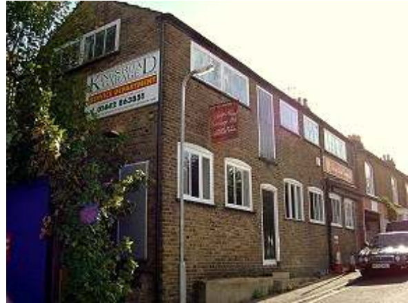
Kings Road Garage, Elm Grove

Kings Road Garage is a mid C19th, 1½ storey industrial building of unrendered buff brickwork. Slate roof with gable ends. Ground floor openings have slightly cambered brick arches. Strong horizontal emphasis to fenestration with 4 window range to upper storey, 2 long windows at each end, divided into paired 3-light windows, with similar single 3 light windows between. Raised plank door between two left hand windows above similar plank door with steps up. Five windows to ground floor all of three lights. All lights are uninterrupted by horizontal glazing bars and, where opening, are top-hinged. Bracket for sign between windows at left end.