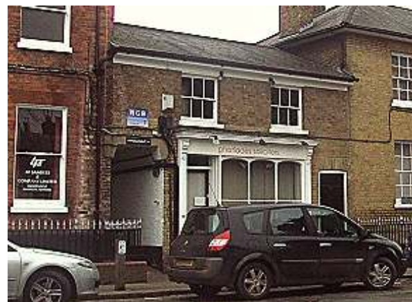
115 High Street

No. 115 High Street is a low 2-storey range, to the left of and formerly servicing Admiral House, now shop. There is a joint to the brickwork suggesting No. 115 was added, but in a complementary style. Slate roof with overhanging boarded eaves, with ridge tucking into eaves of Admiral House to right and abutting the flank wall of 'The Red & White House'. Unrendered buff brick. 2 window range of 3-over-3 paned sashes over central shop front with end pilasters that have scrolled brackets supporting moulded cornice that breaks forward over plain fascia. Large 3 panel front, the windows divided horizontally into 2 large panes and with four-centred arched heads. Low timber panelled stall. Integral slightly recessed door up step which has upper half glazed, 2 panels to base, and plain overlight. Entrance to alleyway to left has cranked head to stone lintel. Doorway to right end with 2 steps and handrail to left hand flank to 6 panelled door with slightly cambered arched head.