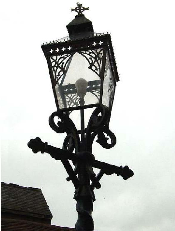
Candy twist lamp posts and lantern