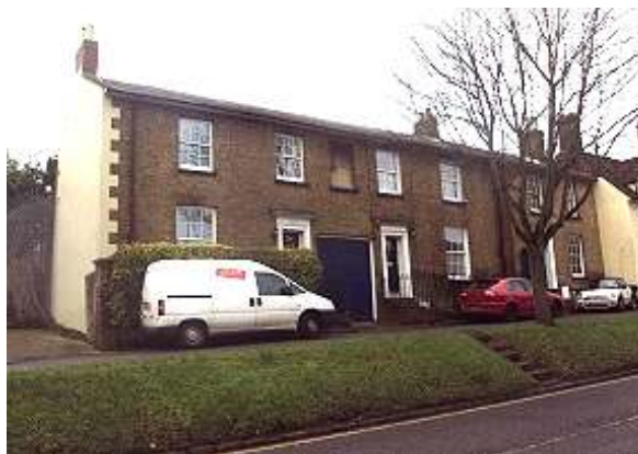
45, 47 & 49 High Street

No. 47 has 2 window range of 6-over 6-paned sashes above similar door and doorcase to No. 45, to left of 6-over-6 paned sash. Steps up to doorway and railings and gate with urn finials to front.