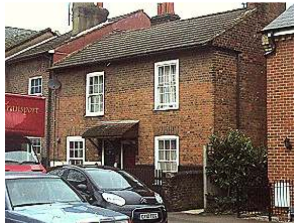
52 & 54 High Street

The change in brickwork continues across to No. 56 (q.v) which suggests they were modified to two full storeys at the same time. Nos. 52 and 54 are an unassuming pair of houses on the busy High Street that retain some traditional fenestration.