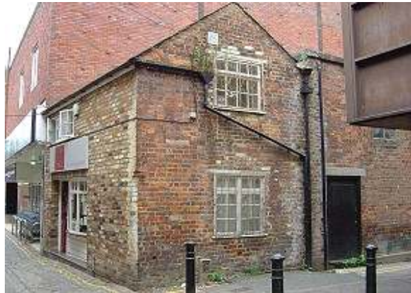
1 Church Lane (The Hair Secret)

No. 1 Church Lane (The Hair Secret) is small brick building, single storey with loft, now used as a shop, which turns the corner of Church Lane and the Wilderness. Much altered but probably early C19th in date. Slate roof with gable end to east end, abutting Tescos at west end. Unrendered brick, chamfered at the corner for turning vehicles, mostly rebuilt in C20th to Church Lane elevation. This incorporates 4 light window above slightly recessed shop front with bow window. Window on each floor in east gable end, Opening toplight of 4-over-8 panes above 2 light casement, 6 panes per light with 2-paned toplight. Rear flat-roofed section facing the Wilderness has plank doors at each end with single casement in between and two casements above all 2 lights, 3 panes per light. Twin louvred grille in ventilation opening towards right end.