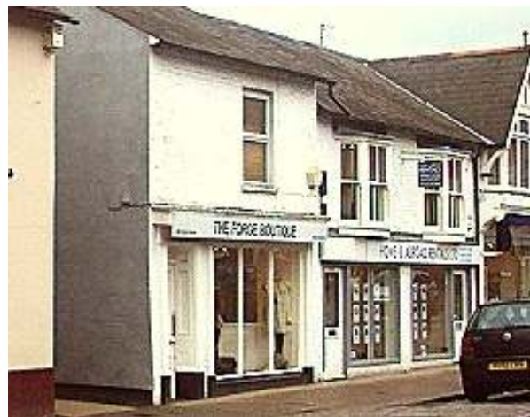
278, 278A & 280 High Street

Nos. 278 and 278A front directly onto the pavement and is the lowest of a series of roofs that steps down from the right end.