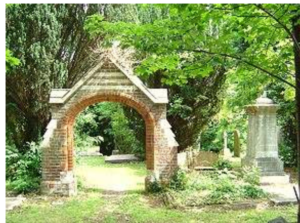
Brick decorative arch, Cemetery, Rectory Lane