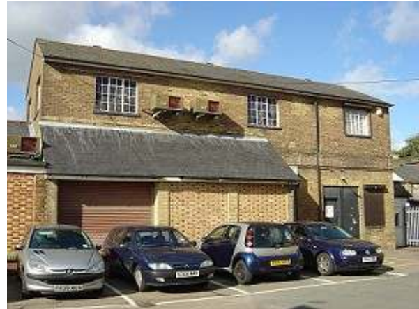
Former fire station

Lower ranges to left end have flat roofed extensions to front, the lower middle section has shuttered garage door to left of blind brick wall in similar