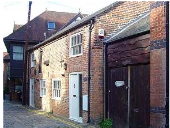
Badger's Drift & Candlemaker's Cottage, Church Lane

Badger's Drift has window on each floor with 2-over-2 paned sash to west gable end, and C21st boarded and glazed roof extension set back from the road returning off the brick rear wing.