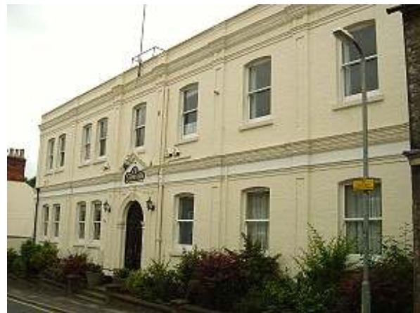
Cooper House, Ravens Lane

Similar single sash to central bay over 'Cooper House' and leaf motif in the open pediment. Stone steps up to semi-circular arched doorway with pilastered surround, and inner moulded architrave incorporating prominent keystone and moulded impost blocks. Door of 6 panels, filling the arch.