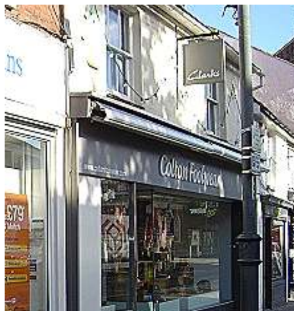
240 High Street

An unassuming shop premises that fronts directly onto the pavement.