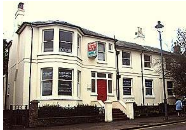
271 & 273 High Street

All windows have 1-over-1 pane sashes. No. 271 has two storey canted bay with hipped roof to left of window (with small window to right) over doorway with single pane sidelights with toplights each side of 6-panelled door with overlight. Brick steps and painted rendered flank walls with capped end piers. No. 273 has 4-window range of sashes on each floor and shallow pilasters between the bays and to right of end window. Dwarf wall to front with chamfered stone capping and ornamental railings with trefoil-headed panels, stepping