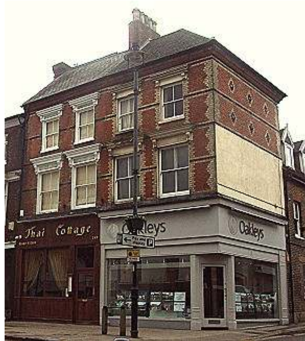
149 & 151 High Street

Nos. 149 and 151 front directly onto the pavement and occupy a prominent position – emphasised by their three-storey height, on the corner of the High Street and Prince Edward Street. No. 149 was a shoe shop and No. 151 was a gent's outfitters in the 1930s.