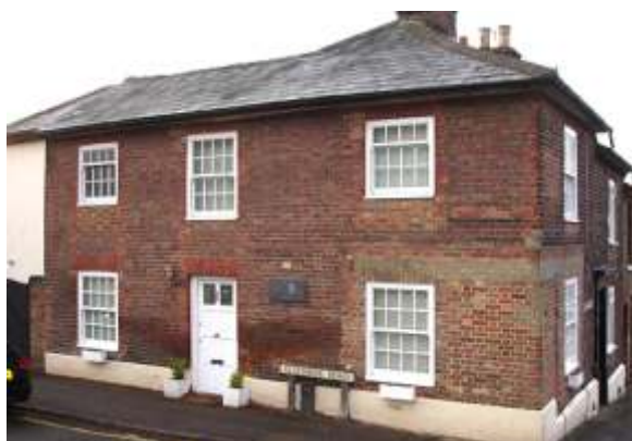
12 Gravel Path

Ellesmere Road elevation has 4-over-8 paned sashes (openings reduced in height) flanking central 8-over-8 paned sash above 8 panelled door, the upper 2 panels glazed, with 8-over-8 paned sash to left. Brickwork shows road sign was attached to brickwork at right end above former shop front.