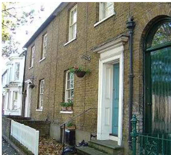
61, 63, 65 & 67 High Street

Nos. 65 & 67 High Street are a pair of mid to late C19th houses in a varied row on the south side of the High Street. C20th roof. Shared brick stack with circular pots. Unrendered buff brickwork and dressings. One room wide and entrance hall with