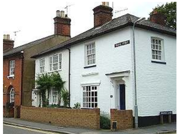
17 & 18 Chapel Street

Chapel Street is composed principally of elegant, modest late C19th semi-detached or terraced housing,