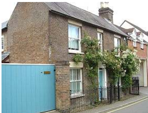
2 Chesham Road

The Berkhamstedian Supplement to Vol LXXI, No. 304, September 1950