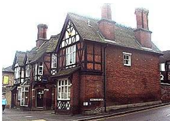
85, 87, 89 High Street

All windows resemble 'cross-mullions' incorporating 2-paned opening casements below the cross mullion. Nos. 85 and 87 have asymmetrical arrangement, No. 85 with a larger projecting 3-light bay gabled window at first floor level with large 3-light window, 3 panes per light; date in Gothic lettering '1865' in 2 framed panels above and cross-bracing in 3 panels below. Single light window with 3 panes to left. Narrower flush window bay to right with gabled roof and 2-light window, 3 panes per light. Pair of single light windows to each facet at the right hand corner with cross-bracing in the panels below. Ground floor has lean-to porch with fishscale tiled roof supported on shaped brackets springing from foliate corbels. Stone steps up to 4-centred arched doorway with chamfered reveals and timber door with chevron planking below 2 glazed panes at the top. Four-light window below projecting