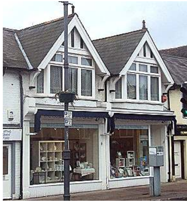
274 High Street

No. 274 fronts directly onto the pavement and sits in a range of modest shops which retain their C19th form and which stretch from 258-280 High Street.