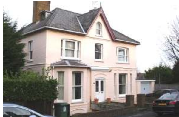
24 Charles Street (Marlborough House)

No. 24 Charles Street is a detached house. Probably late C19th. Hipped late roof with axial; buff brick stacks to each hip. Small flat-roofed dormer forward of left hand chimney. Prominent central gable with painted bargeboards and shaped finial and drop-finial. Painted brickwork with moulded plat band and plinth. Two storeys with attic and full basement.