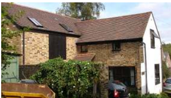
The Smoke House, Middle Road

Main range has double plank doors to upper storey above French window with two glazed leaves. Front wing has 2-over-2 paned sash on each floor. Inner face