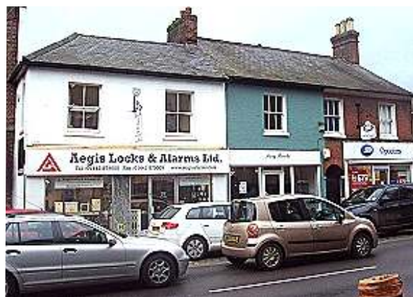
242, 244, 246 & 248 High Street

Nos. 242, 244 & 246 High Street consists of pair of retail premises with accommodation over. Early to mid C19th. Slate roof with gable to right end and unrendered brick stack at each end, that to right has assortment of pots. Downpipe at left end/ Painted dentilled cornice. Brick, painted to left side and colourwashed red brick to right. Timber shopfronts, that to right modified in late C20th. Built parallel to the High Street with 3 window range of 3-over-3 paned sashes, very slightly cambered heads to the arches above central semi-circular arched doorway with moulded impost and painted timber door to alleyway. Double fronted shop front to each side, with large panes, that to left has panelled stall risers and cants