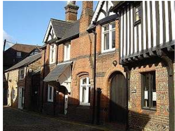
6 Church Lane (Court House Cottage)

No. 6 Church Lane is an Edwardian, architect-designed two-storey house, with covered carriage entrance at west end and abutting the Court House at east end. Unrendered red brick with chamfered plinth and blue brick banding across the building at window sill level on each floor and at head of ground floor windows. Slate roof with gable end and brick stack with two pots to west end. Cast iron downpipes to each side of the window gables. Prominent lateral front stack with single pot heating first floor, rising off corbelled brickwork to each side of ground floor window, with tumbled in brickwork at each of the three splays as the projecting breast narrows to a square shaft. Dentil coursing to the stack caps.