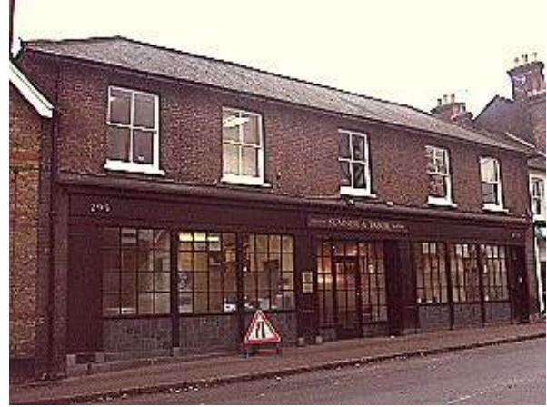
295, 297 & 299 High Street

Nos. 295, 297 and 299 High Street has ground floor shop premises, now offices, spanning length of ground floor, with accommodation also now offices above. Late C19th with C20th shopfront. Slate roof with hipped ends, no stacks. Unrendered purple brick to first floor and timber shop front with vertical slate 'paving' to the stall risers. Long near symmetrical range with 5 window range of 2-over-2 paned sashes (2 right hand sashes only have single panes to the lower light.) Ground floor has balanced arrangement with continuous fascia over boarded panels flanked by pilasters at left end and two each side of slightly recessed central entrance bay. This has glazed door flanked by 12 paned lights and with 2 paned overlight. Intermediate pilasters break up the large flanking windows into three 16 paned lights. No. 299 has plastered doorcase and 4-panelled door at right end.