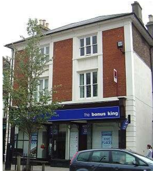
179 High Street

No. 179 fronts directly on the pavement. An early and daring example of a shop with large plate glass windows and Art Nouveau detailing. Previously the Star Tea Co Ltd (tea merchants).