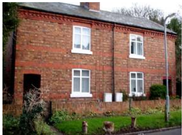
26 & 27 Station Road

Nos. 26 & 27 are a pair of semi-detached houses. Two storeys. Early C20th. Slate roof with gable ends and shared central unrendered brick ridge stack. Central downpipe. Unrendered brick, mixing red, orange and buff brick with dark red dressings to the openings and used as banding across the whole façade at sill level to both storeys and above the ground floor windows, and also used in the cornice which has oversailing courses incorporating headers in the second band of two courses to form dentils, extending up into the course above with concave bricks above each dentil. All openings have slightly cambered arches, the arches of the windows to the upper floor breaking into the cornice. (See also 56, Lower Kings Road, q.v.) Symmetrical plan with adjacent single inner rooms and unusual entries at each end where the doorway is both recessed and at right angles on the inner face of the opening. Each house has a single 2-light cross-window on each floor. Doors not visible.