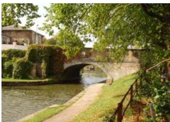
Road bridge over the Grand Union Canal

Described as The "New Brick Bridge" of 1819 it crosses the Canal by the former Castle public house at T-junction of Castle Street and Station Road. Tow path on north side. The original bridge has undergone only a few alterations in nearly 200 years. Plaque on east outer parapet wall records Francis Egerton of Berkhamsted, The Canal Duke, 1736 to 1803.