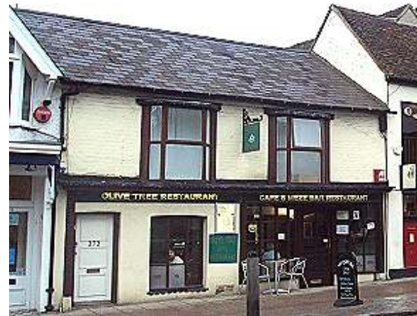
270 & 272 High Street

Nos. 270 and 272 fronts directly onto the High Street and forms an anchor in this range of modest shops with the roofs stepping down from the right and which retain their C19th form.