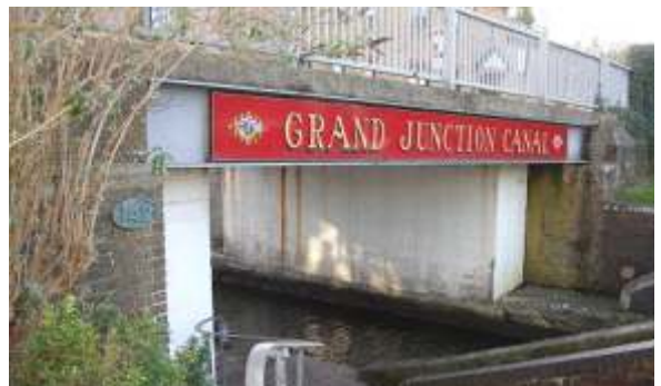
Road bridge over Grand Union Canal

The first bridge in the area to cross the canal was at this point on Raven Lane next to The Boat public house and is clearly shown on a map of 1811. It has since been largely re-built in concrete and steel with metal railings to each side. Painted signs 'Grand Junction Canal' on west side, 'Port of Berkhamsted' on east side. Early stone steps and metal handrail down on west side from pavement to north side towpath