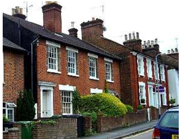
7, 8, 9 & 10 Holliday Street

Nos. 9 and 10 Holliday Street are a pair of two-storey semi-detached houses set slightly back from and adjoining Nos. 10 & 11. (q.v.). Red brick with painted lintels and unusually buff brick 'in and out' quoins to the openings. C20th tiled roof, gable end to left. Central