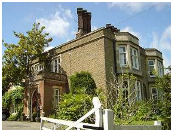
The Old Rectory, Rectory Lane

Former Rectory. Mid C19th, altered at rear in C20th. Slate roof largely concealed by brick parapets. Two clusters of Tudor style chimneys with diagonally set brick shafts, 3 shafts to left side, 4 shafts to right side. Unrendered buff and some grey bricks with stone dressings to the cornice, parapet, bays, window surrounds and porch, which is constructed of dark red bricks. Double-fronted cross-plan with principal room each side of hall with principal entrance on east side. Two storey canted bay window with two-light cross window and single-light cross-windows to the eaves; upper floor lights divided into two panes, each side of semi-circular arched doorway, now blocked. Porch to east side has parapet, pedimented at the centre over stone heraldic shield with swags and festoons. Moulded cornice has grotesque creatures at the corners. Tudor style doorway with moulded stone architrave and hoodmould terminating at the end of the returns in stone bosses. Steeply pointed arched doorway with foliated spandrels. Timber doorway of two leaves, 3 panels to each leaf, with diagonally set planks. Single light windows to each cheek. Irregular 2 and 3-light cross windows with slightly cambered