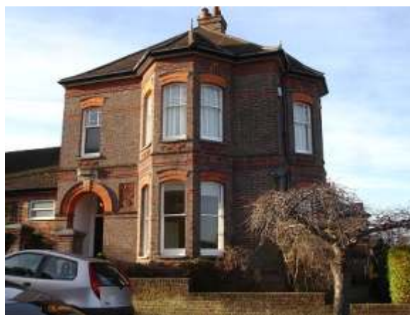
7 Cowper Road

All windows have cambered arches with twin rows of bricks forming the arches, the upper row breaking forward slightly and with moulded upper edge. Sashes are 1-over-1-panes, except that the upper floor top lights are divided into 9 panes, the outer panes being narrower. Canted bay window rising through two storeys and with slightly swept hipped tiled roof, the window openings being of a similar size to centre and to cants. Similar single sash over semi-circular arched doorway, the arch impost continues as moulded bands to each side and with stone keystone and dressed stone inset into plat band above topped with brick panel incorporating swags. This motif is repeated below each of the upper storey windows. Recessed 6 panelled door with glazed overlight incorporating gold lettering 'Cowper House'. Rectangular moulded brick panel to right has bowl with handles at base and four foliated panels above. C20th single storey extension