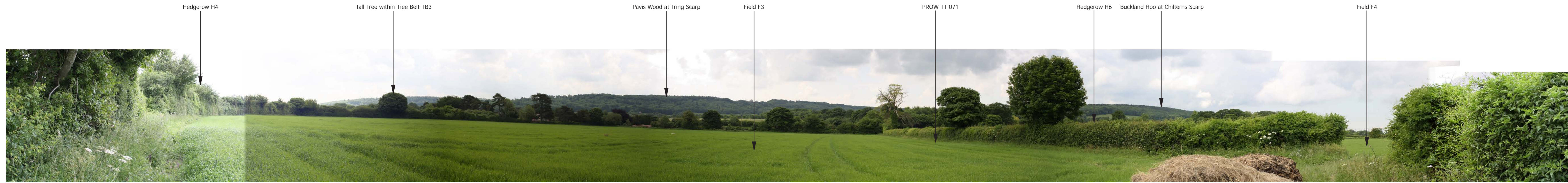
SITE APPRAISAL PHOTOGRAPH D

LAND WEST OF TRING SITE APPRAISAL PHOTOGRAPHS C & D JUNE 2012 PROJECT NO. 21156