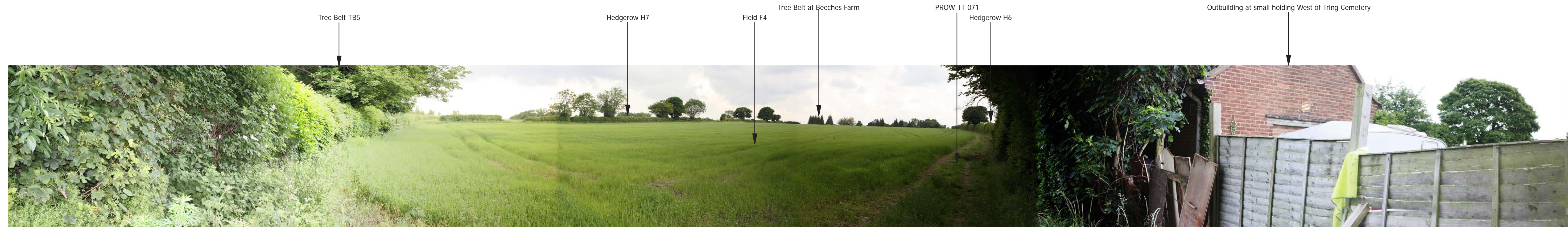
SITE APPRAISAL PHOTOGRAPH F