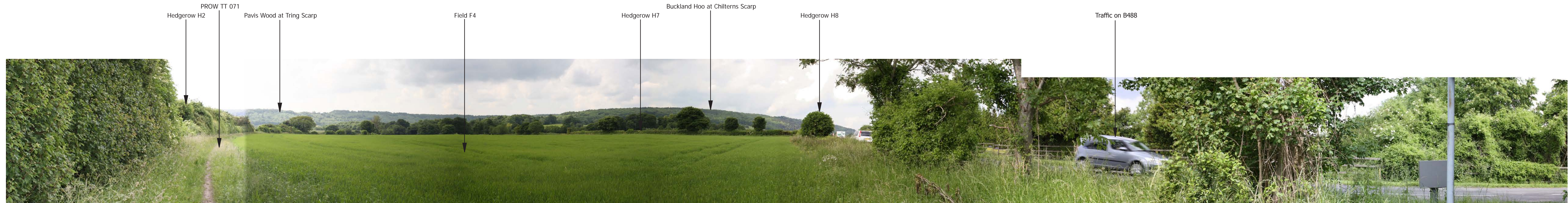
SITE APPRAISAL PHOTOGRAPH E