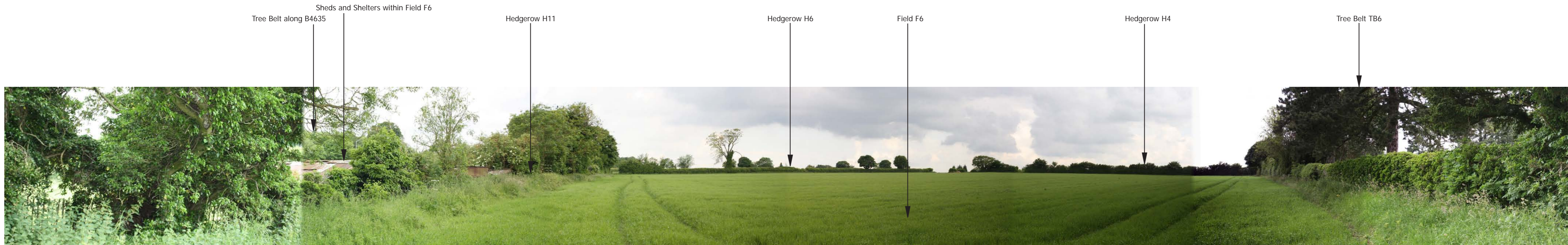
SITE APPRAISAL PHOTOGRAPH I