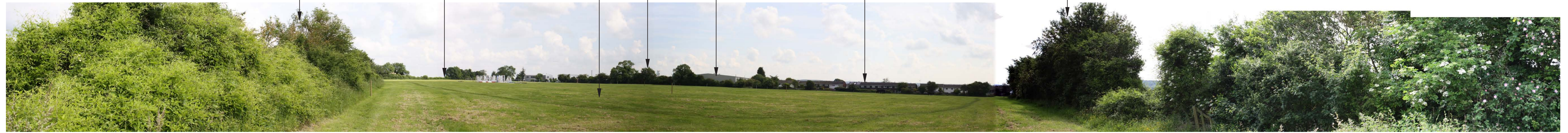
SITE APPRAISAL PHOTOGRAPH B