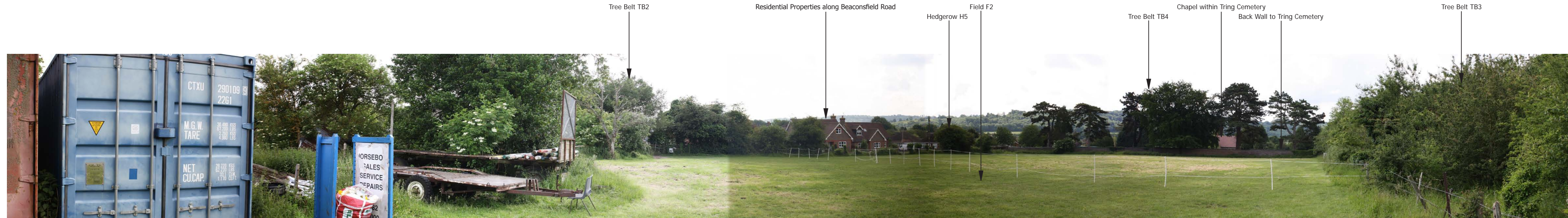
SITE APPRAISAL PHOTOGRAPH C