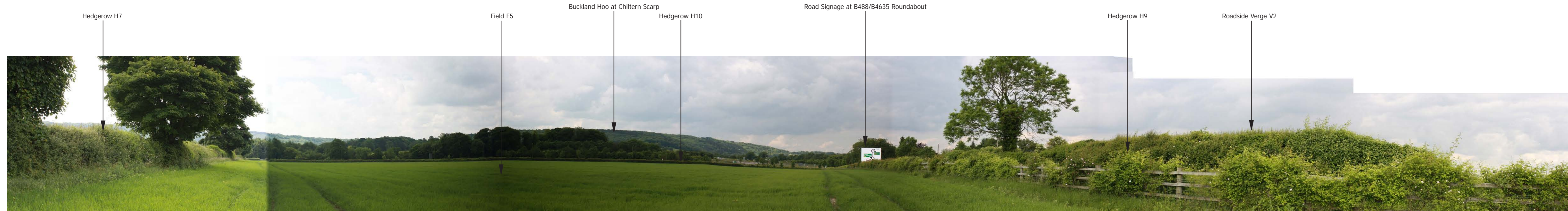
SITE APPRAISAL PHOTOGRAPH G