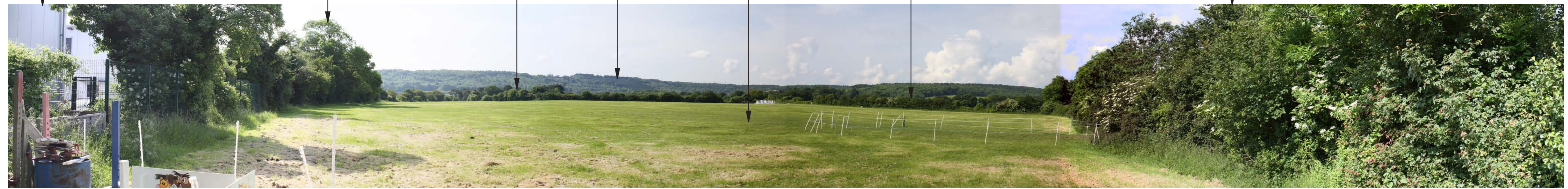
SITE APPRAISAL PHOTOGRAPH A