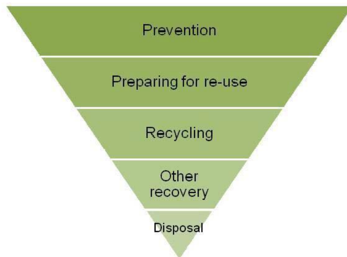
Figure 1: The Hertfordshire Waste Hierarchy

2.20 Waste management policies included in district/borough local plans, should incorporate the principles of the Hertfordshire Waste Hierarchy as shown below. This has been replicated from the adopted Waste Core Strategy and Development Management Policies document.