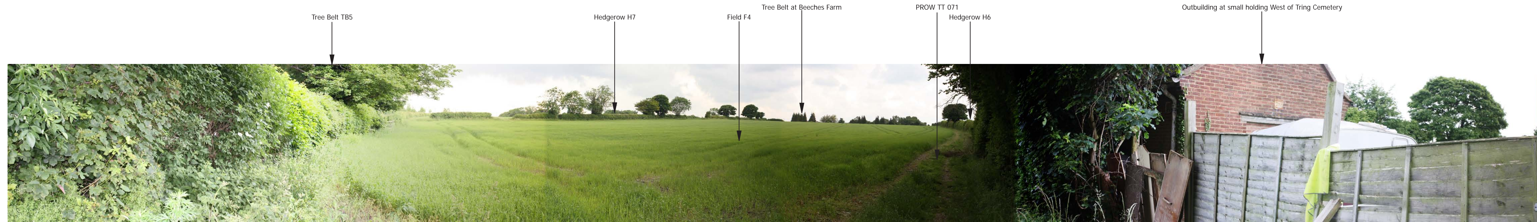
SITE APPRAISAL PHOTOGRAPH F