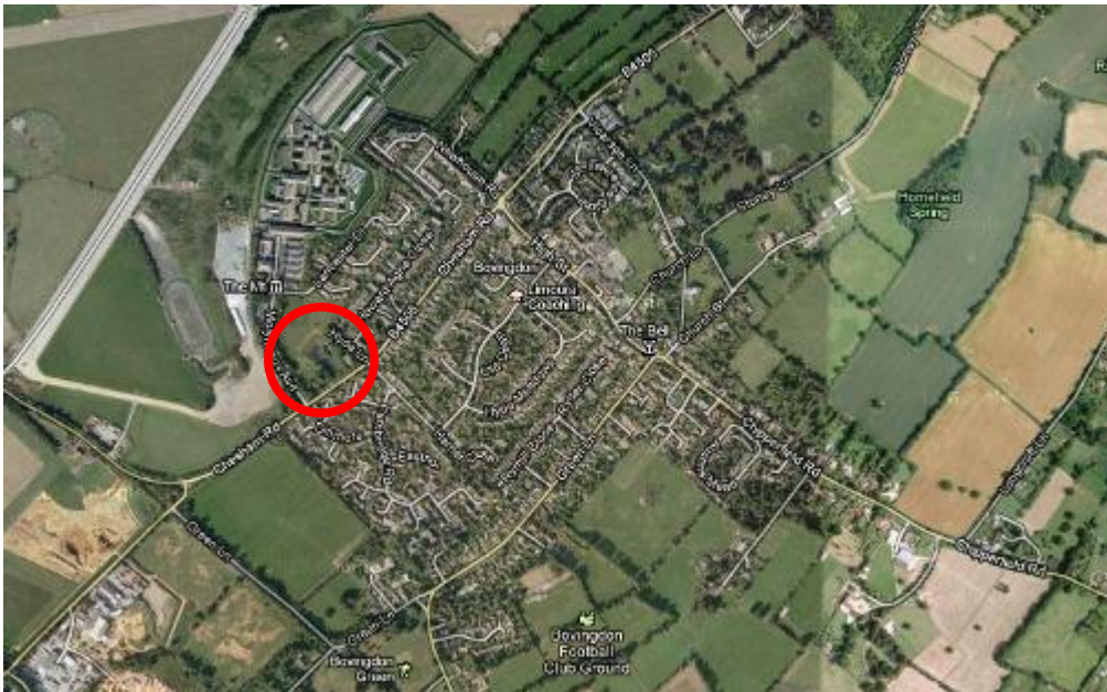
Figure 1: Context Plan of site in context of Bovingdon – Site area circled in red

Local Allocation LA6 is situated to the south of The Mount Prison and is separated from the prison itself by Molyneux Avenue and Lancaster Drive. This area is referred to as “the site” within this statement (see figure 1).