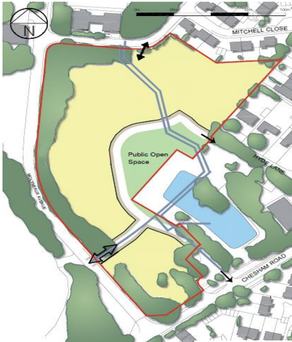
Figure 3: Masterplan Framework diagram

Taking into account the known constraints of this site identified within this report, the masterplan (Figure 3) demonstrates that it is viable to develop this site for residential uses.